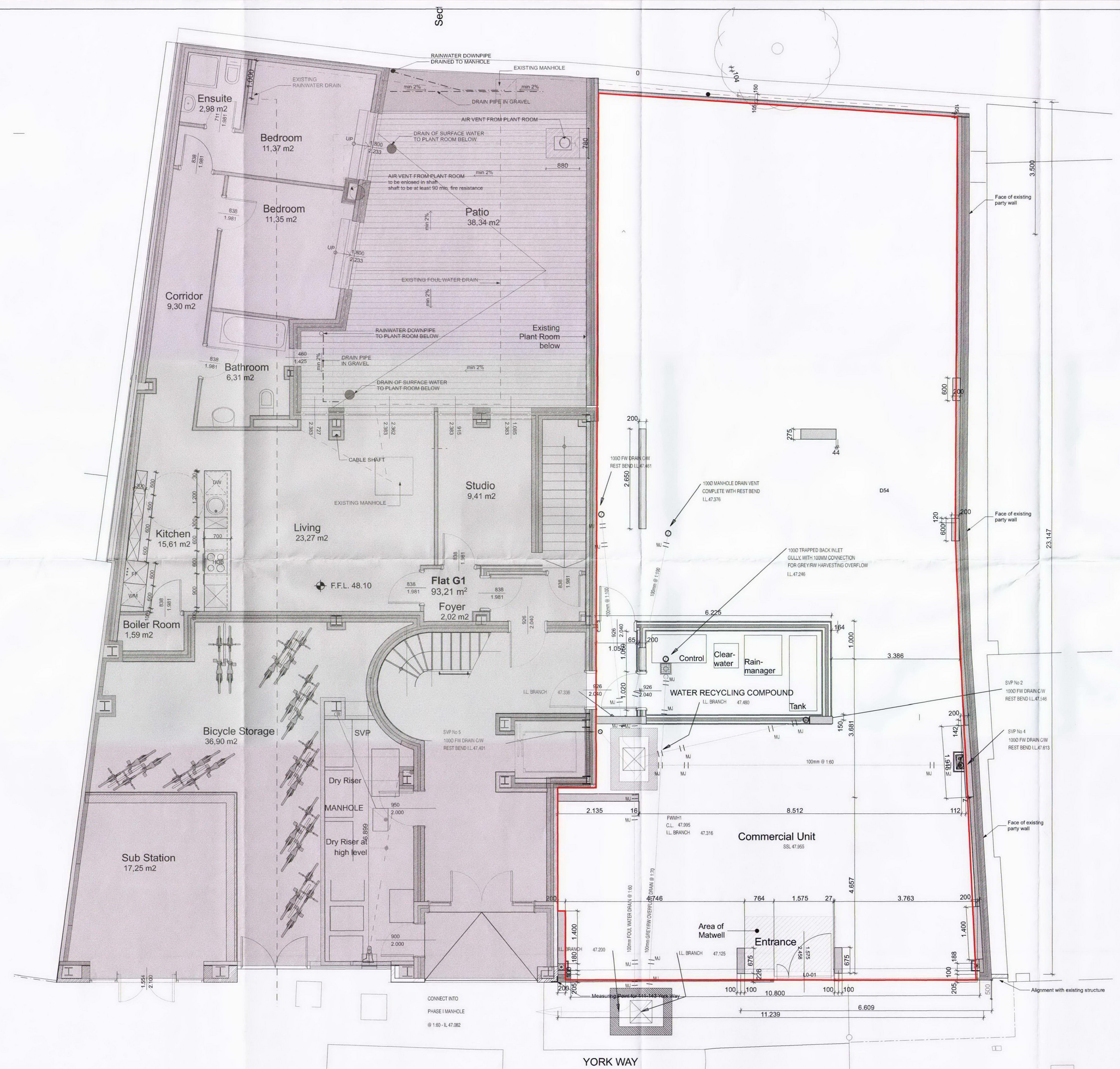
141-143 York Way Ground Floor Scale 1:50