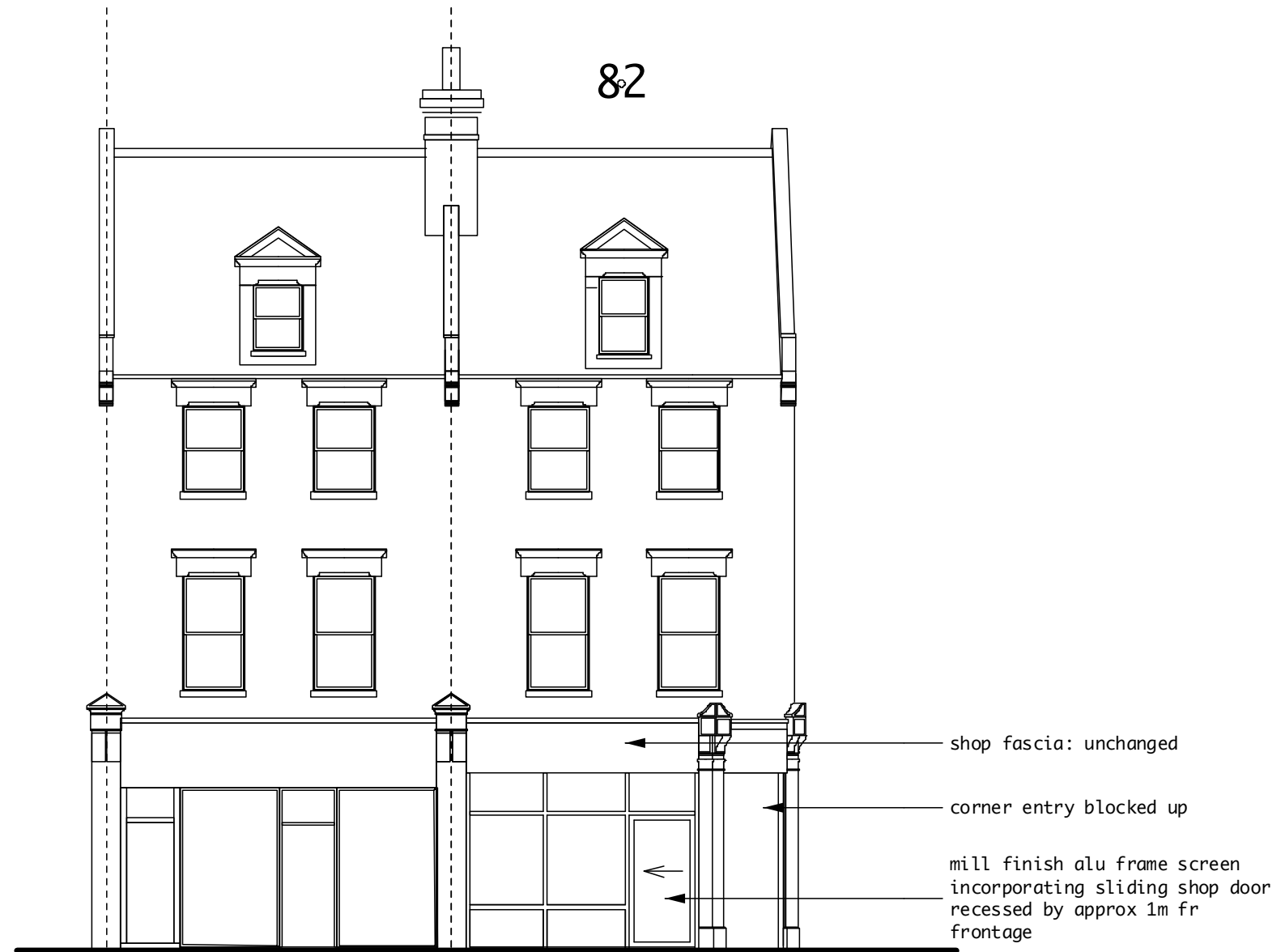
1 Mansfield Rd elevation Scale: 1:100