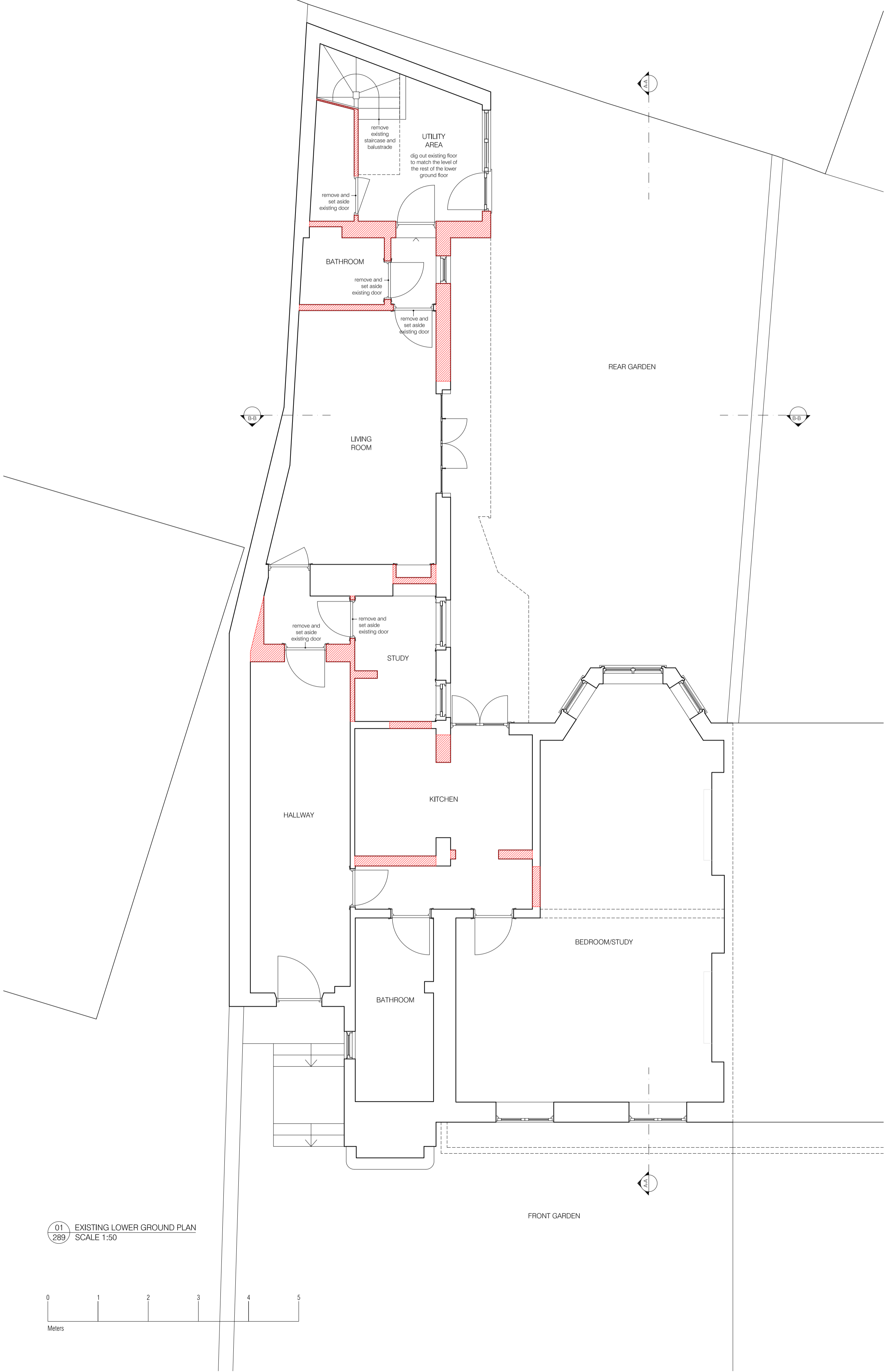
01 EXISTING LOWER GROUND PLAN 289 SCALE 1:50

These plans and specifications prepared by Brian O'Reilly Architects as instruments of professional service shall remain the property of Brian O'Reilly Architects. These plans may not be copied or re-used without the express written consent of Brian O'Reilly Architects. The use of these plans for construction is permitted only when specifically released for construction reference by a dated authorised signature. These plans are project and site specific and shall only be used for their intended purpose unless otherwise permitted by written consent of Brian O'Reilly Architects. All dimensions shown are indicative and must be double checked on site by the contractor. Any discrepancies found must be reported to Brian O'Reilly Architects. DO NOT SCALE FROM THE DRAWING