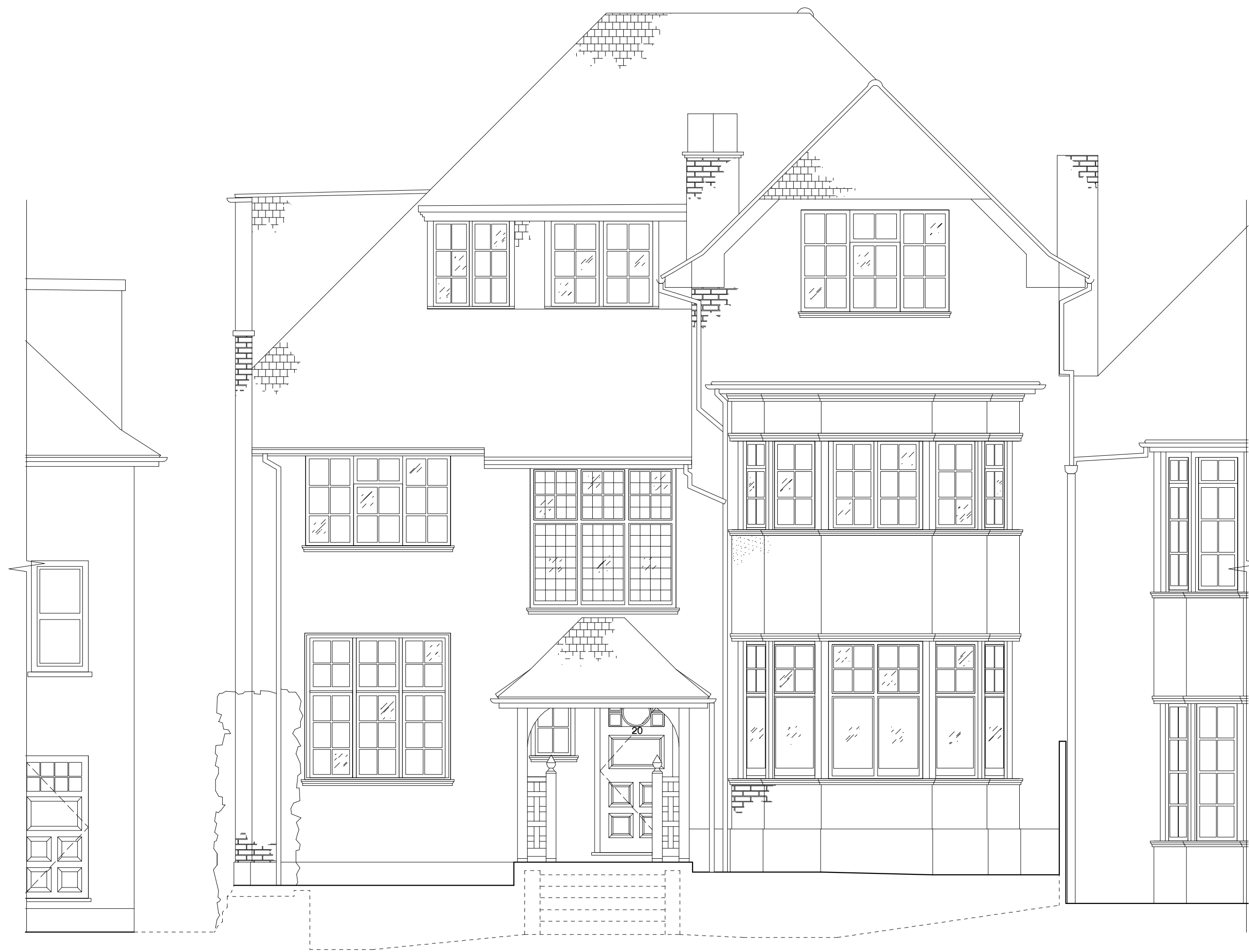
01 Existing Front Elevation