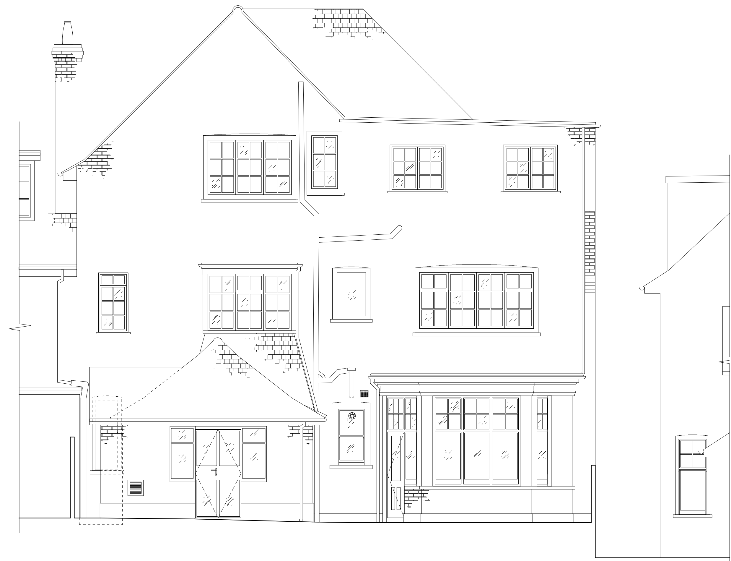
02 Existing Rear Elevation