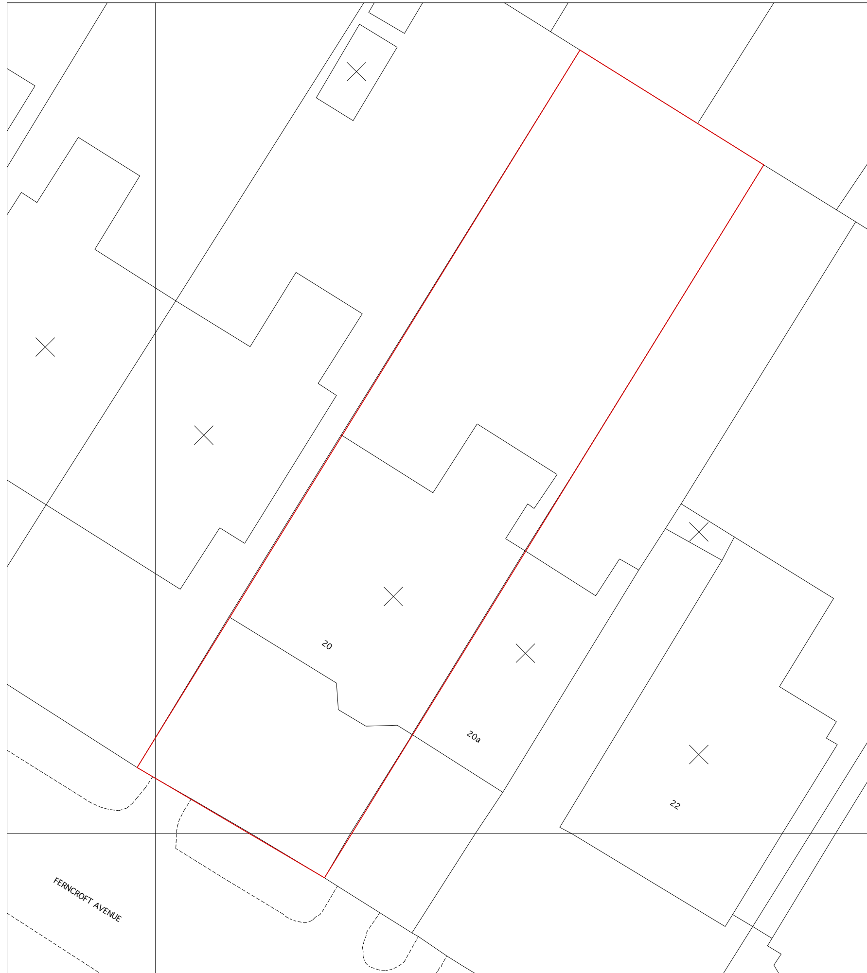
02 Site Plan 1:200