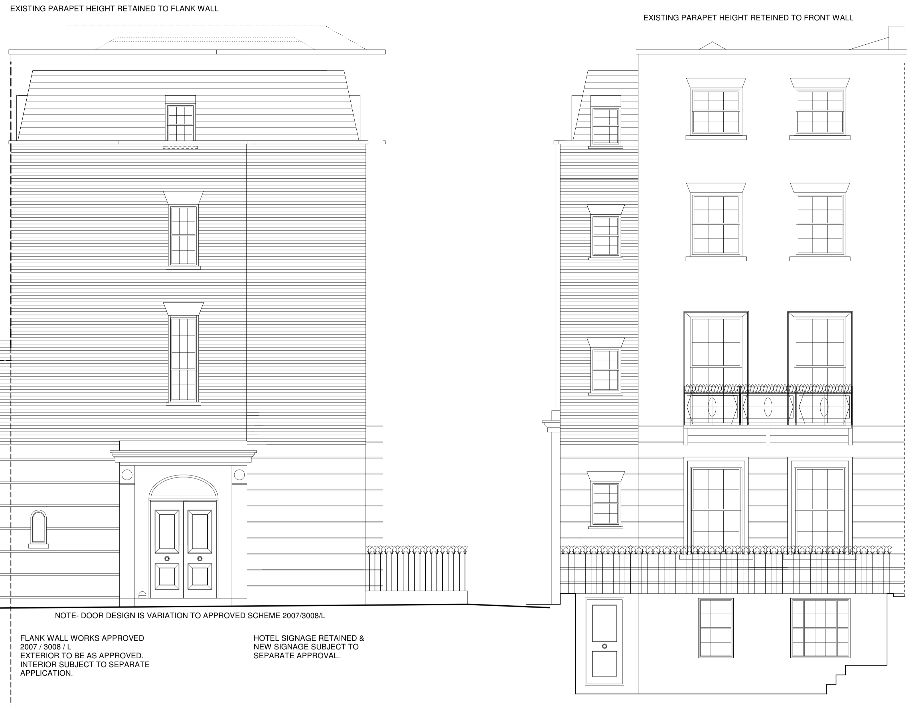
ARGYLE SQUARE ELEVATION

RETAINED PARAPET WALL TO BOUNDARY NO CHANGE REPLACEMENT ROOF TO INFILL SECTION