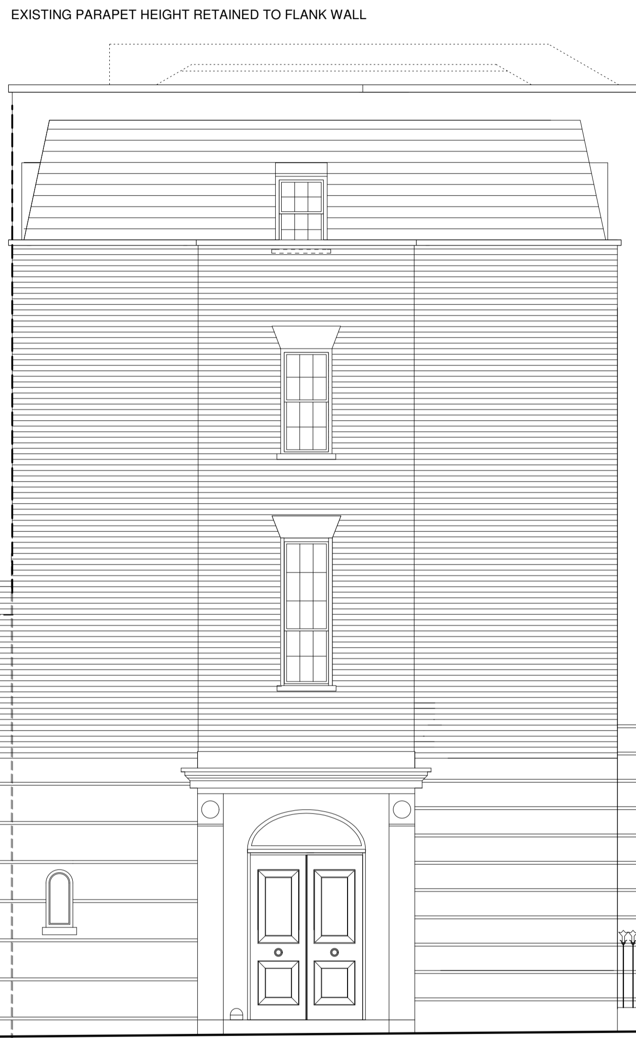
ARGYLE SQUARE ELEVATION