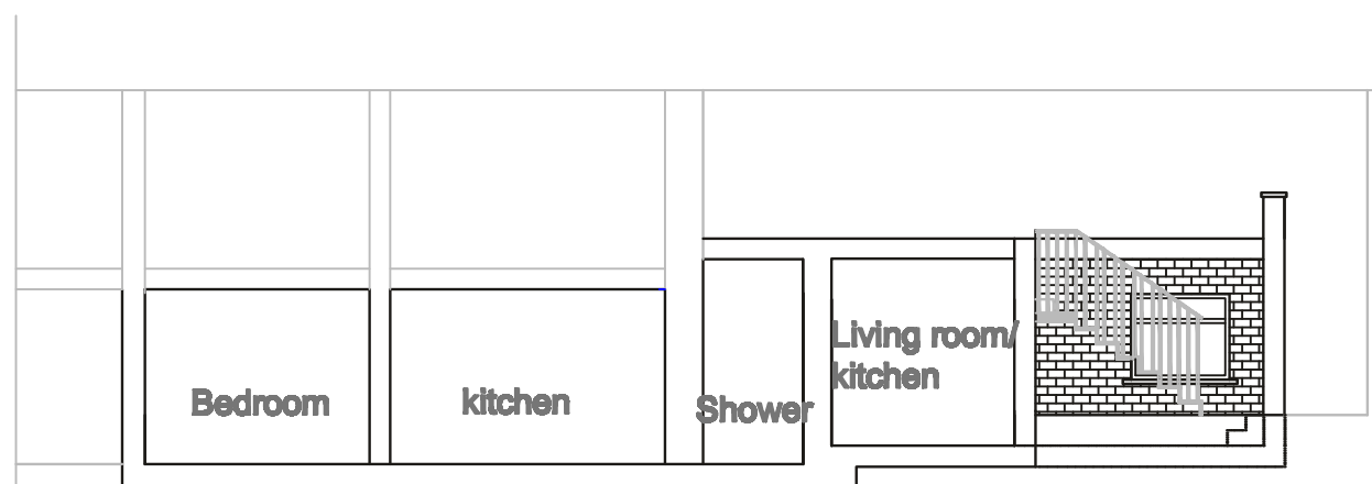
Section B-B (as existing)