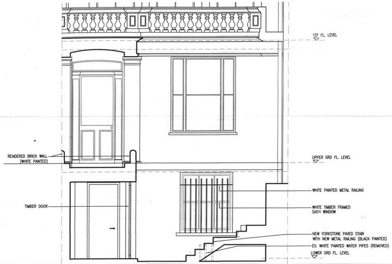
PROPOSED FRONT AREA ELEVATION SECTION BB