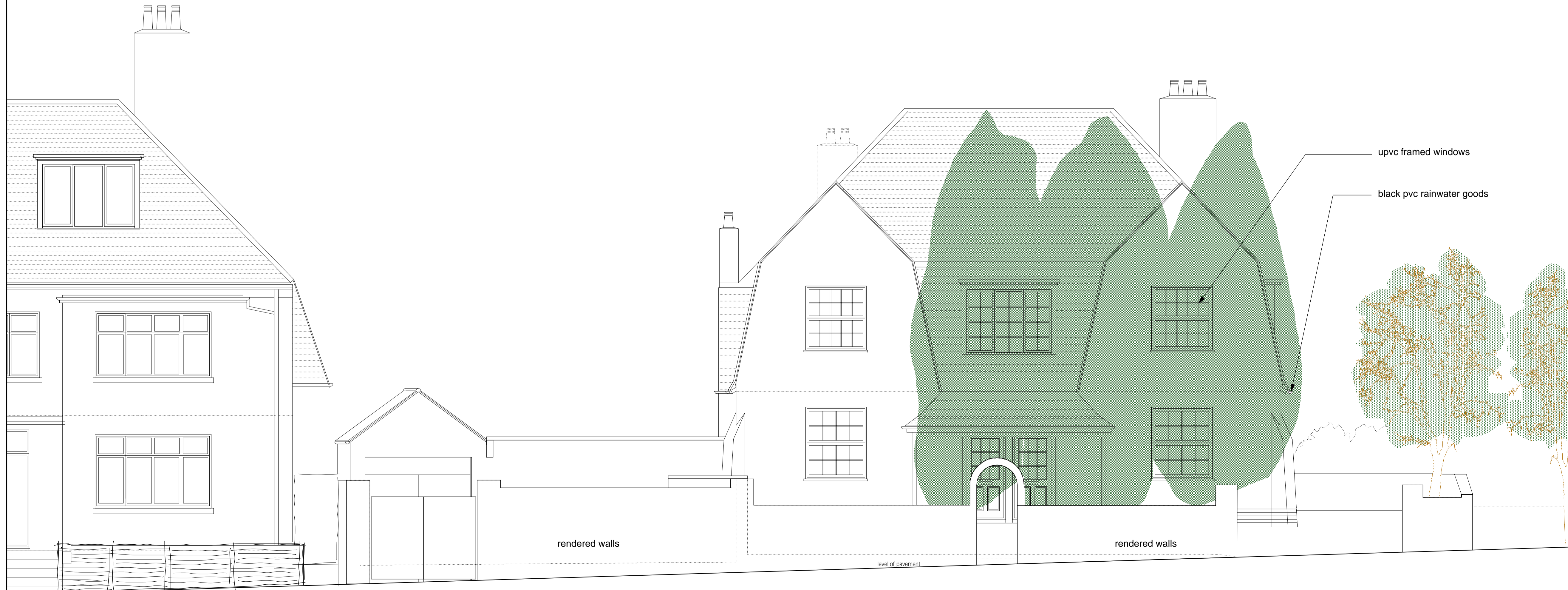
Front Elevation as Existing from Pavement