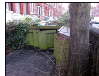
Existing bin enclosure of no.41 Canfield gardens front garden.

Front elevation from GF level_View towards the road_EXISTING