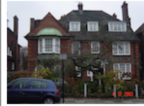
45 REDINGTON ROAD LONDON NW3 7RA