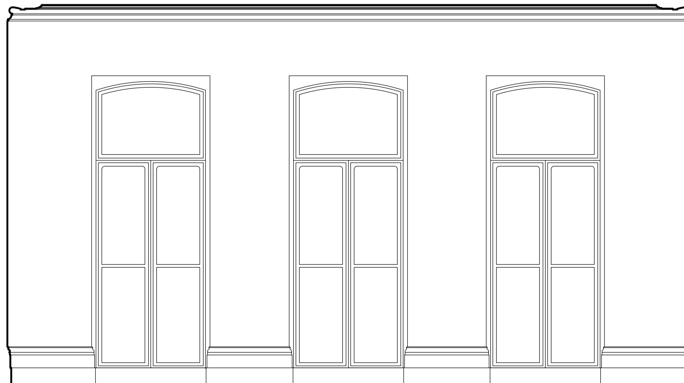
DRAWING ROOM (SE)