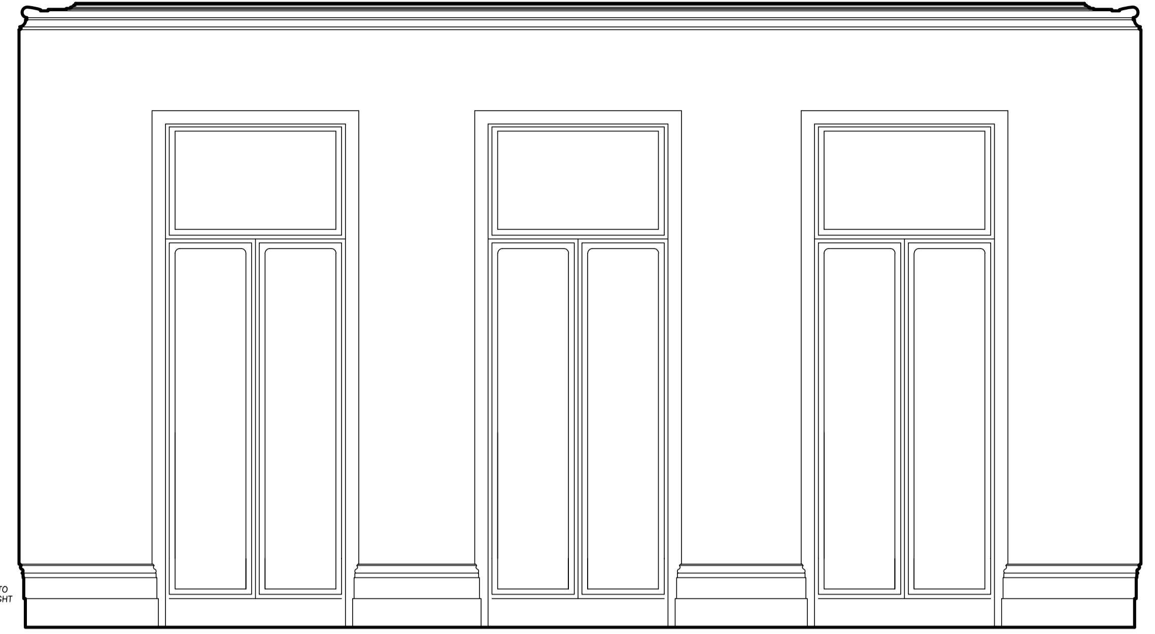
DRAWING ROOM (NW)