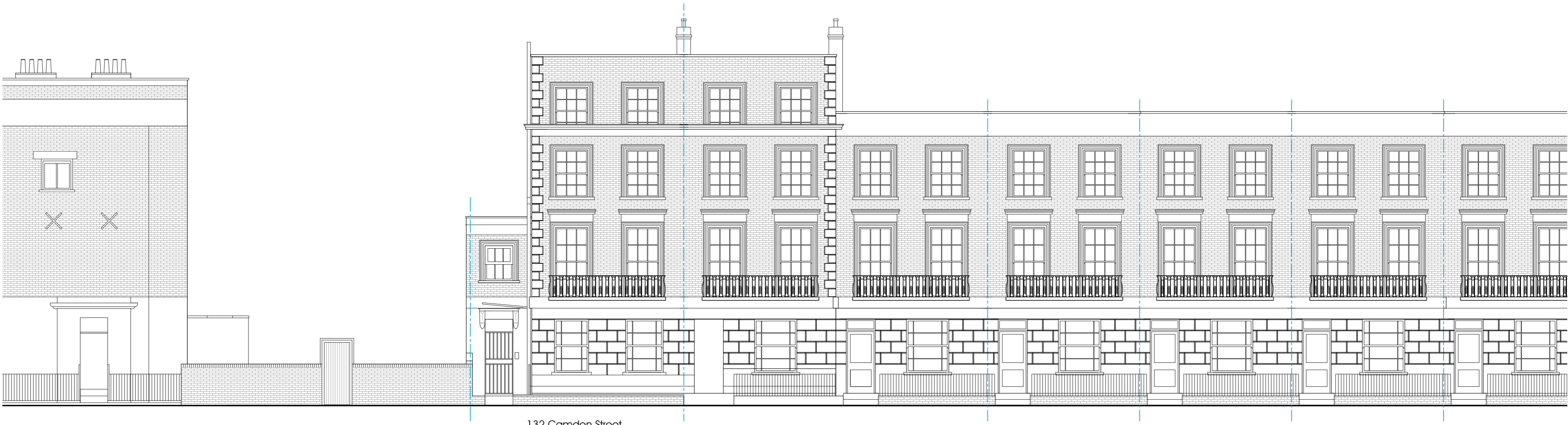
132 Camden Street