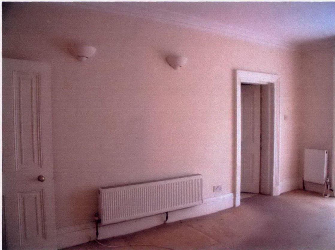
Figure 1 Existing Reception Wall to be altered