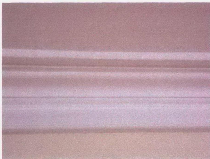
Figure 3 Existing Cornice