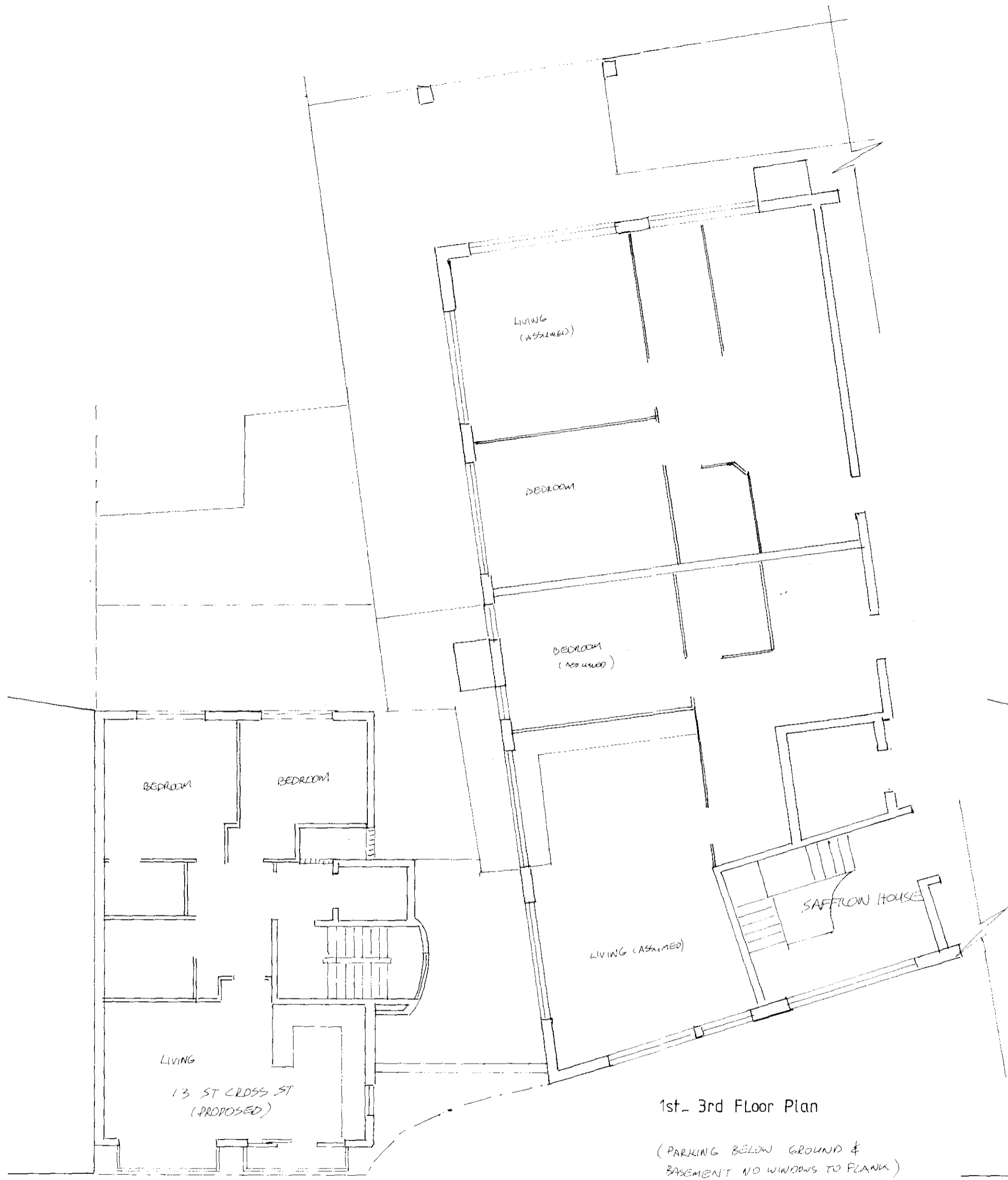
1st- 3rd Floor Plan

(PARKING BELOW GROUND & BASEMENT NO WINDOWS TO FLANK)