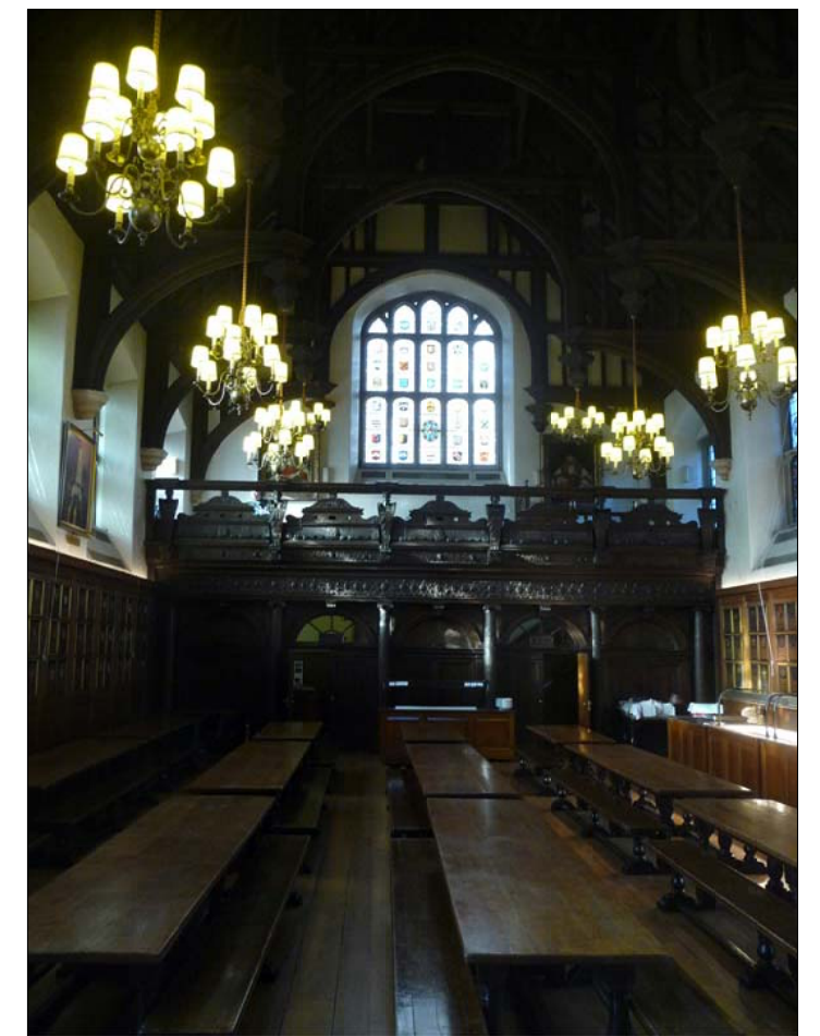
view of balcony from Hall as existing