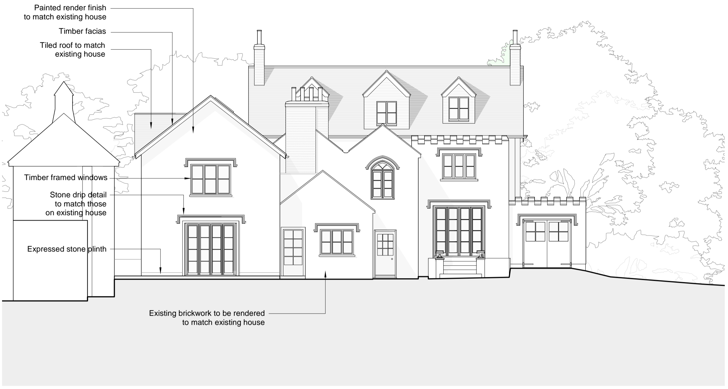
01 NORTH ELEVATION A0106 PROPOSED 1:100

Planning These drawings are for Planning Purposes must not be used for any other purpose without the express permission of Canaway Fleming Architects. These are not for detailed construction purposes.