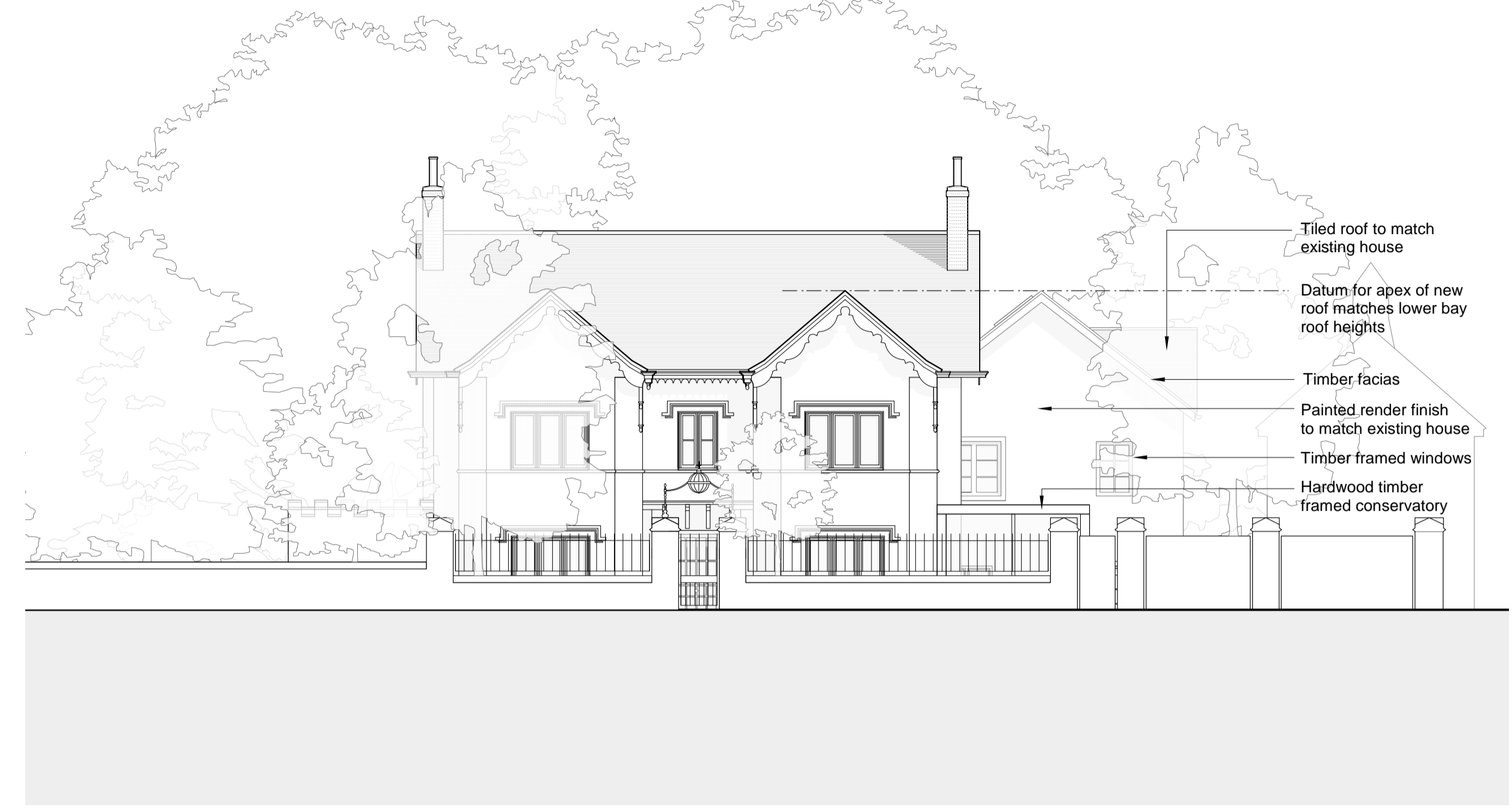
02 SOUTH ELEVATION A0106 PROPOSED 1:100