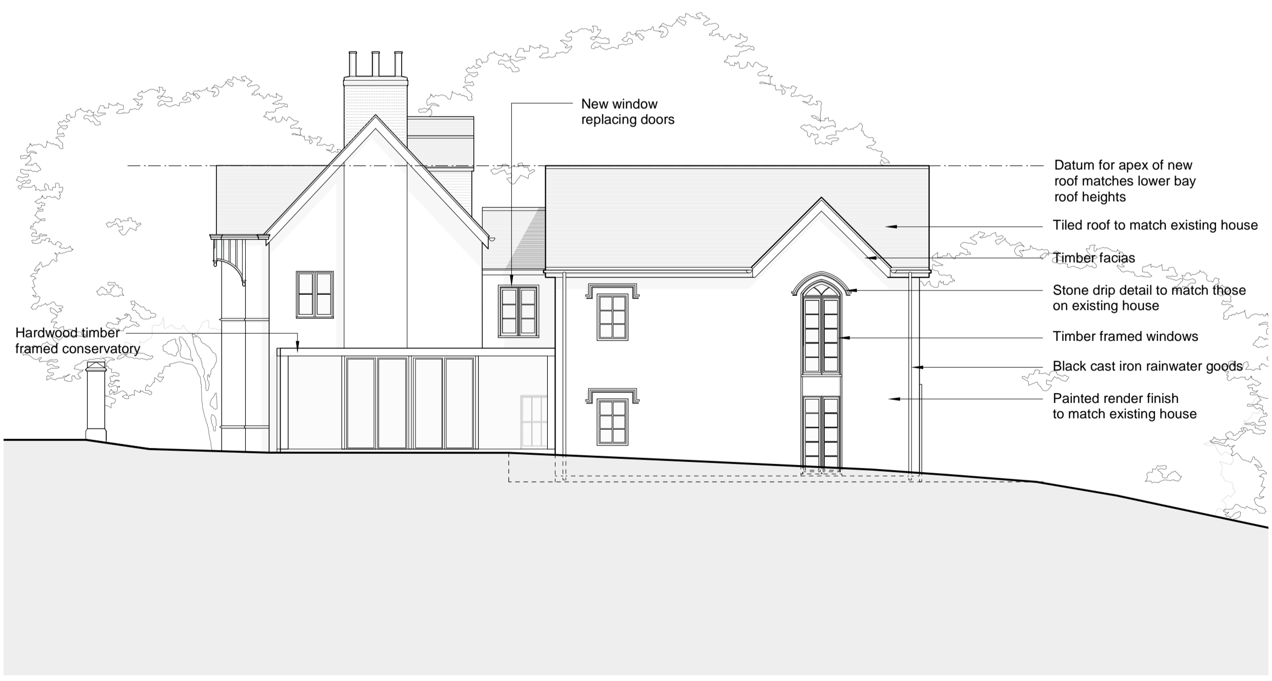
03 EAST ELEVATION A0106 PROPOSED 1:100