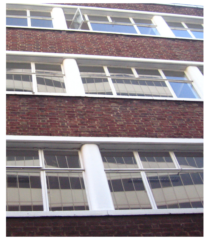
Facade of No.6-8 Emerald Street