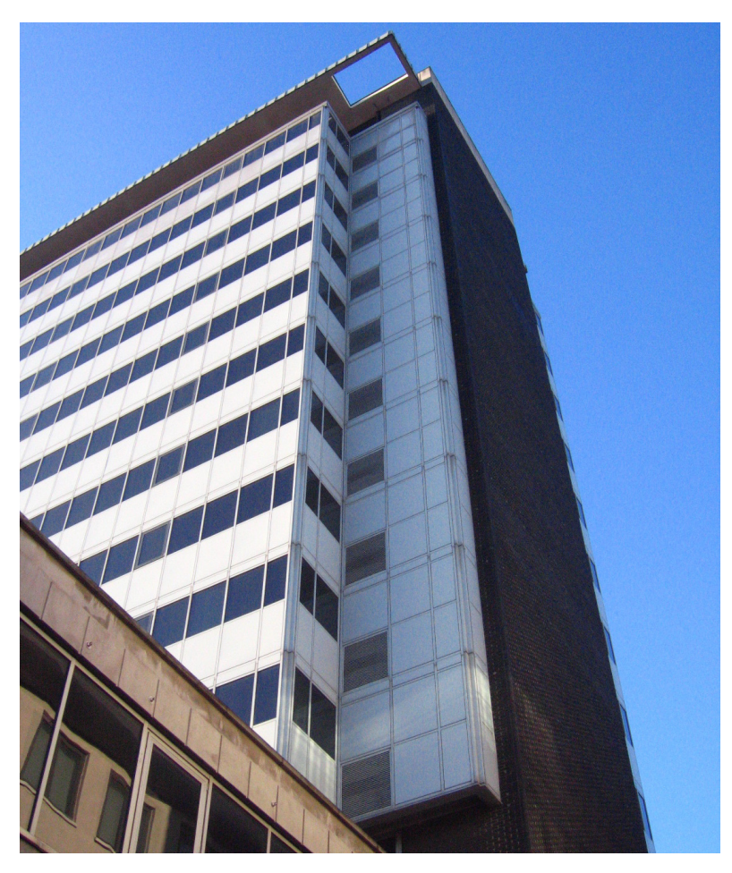
The Police Station