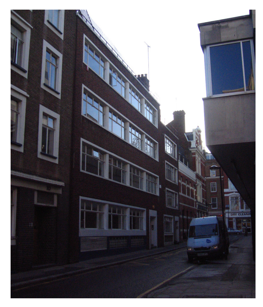
View of No.6-8 from Emerald Street