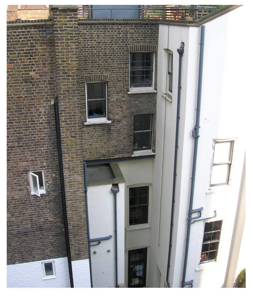
View of No.38 Great James Street from the roof of No. 6-8 Emerald Street