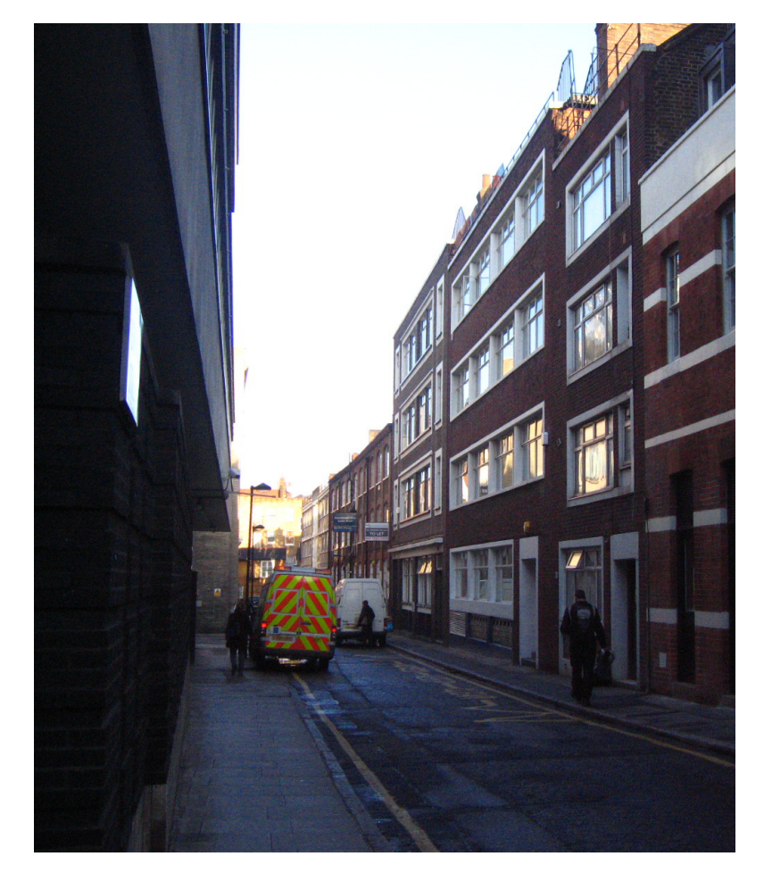
View of No.6-8 from Theobald's Road