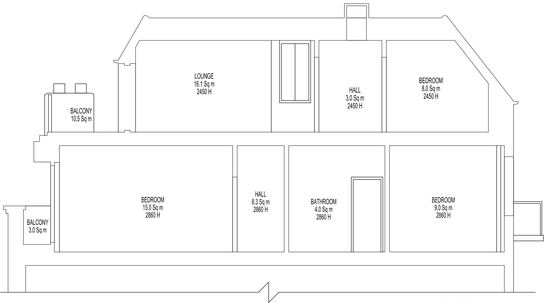
EXISTING SECTION A - A