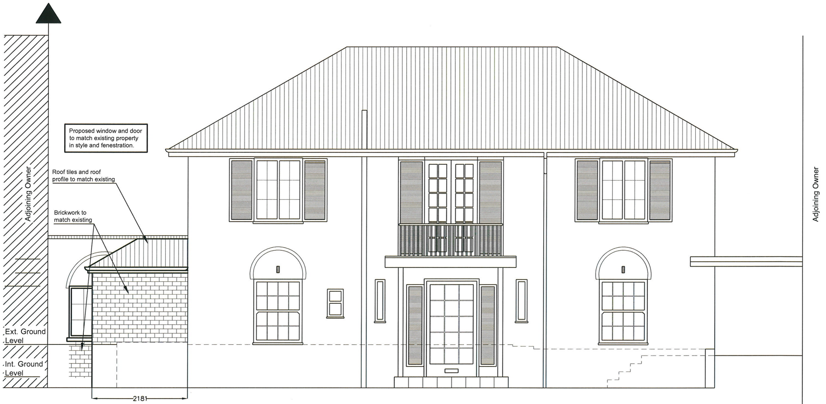
FRONT ELEVATION PROPOSED