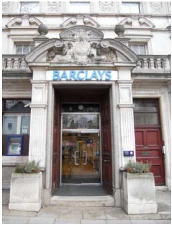
External View as Existing