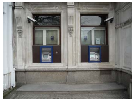
Existing Exterior View