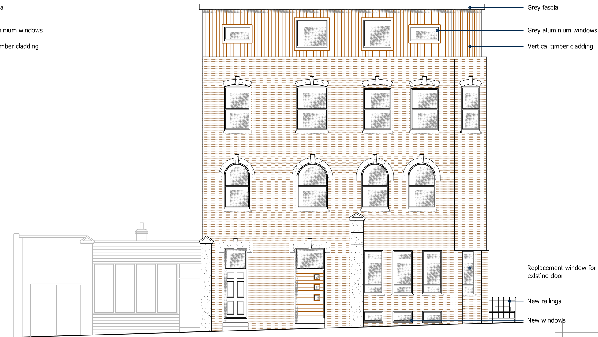
Proposed Kingsgate Road Elevation 1:100