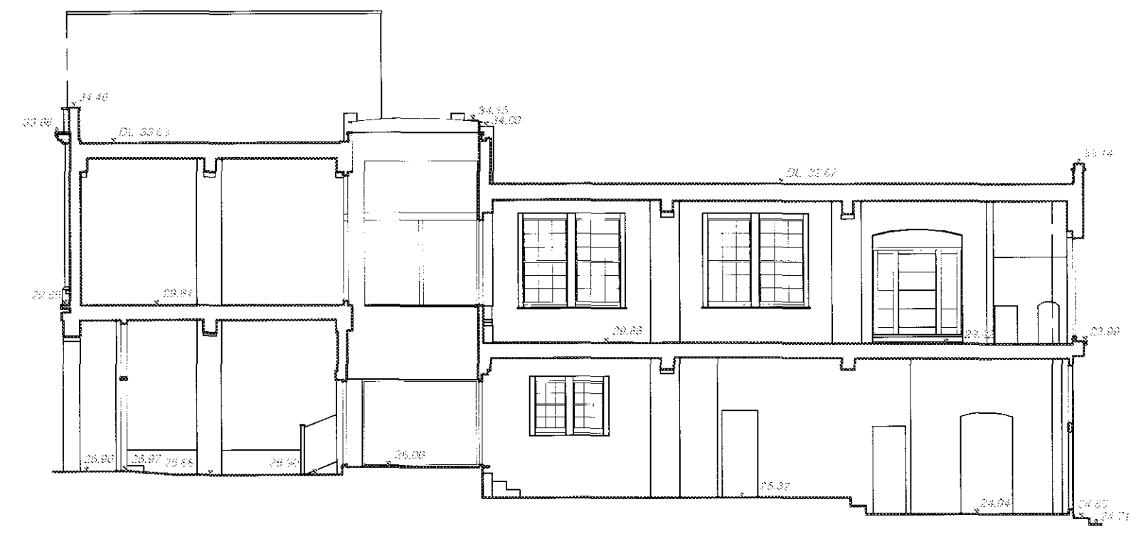
SECTION C - C