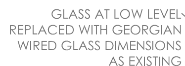
CRITICAL BARS STEEL TO MATCH STEEL FRAME WORK POWDERCOATED BLACK RAL 9011- bonded straight onto glass