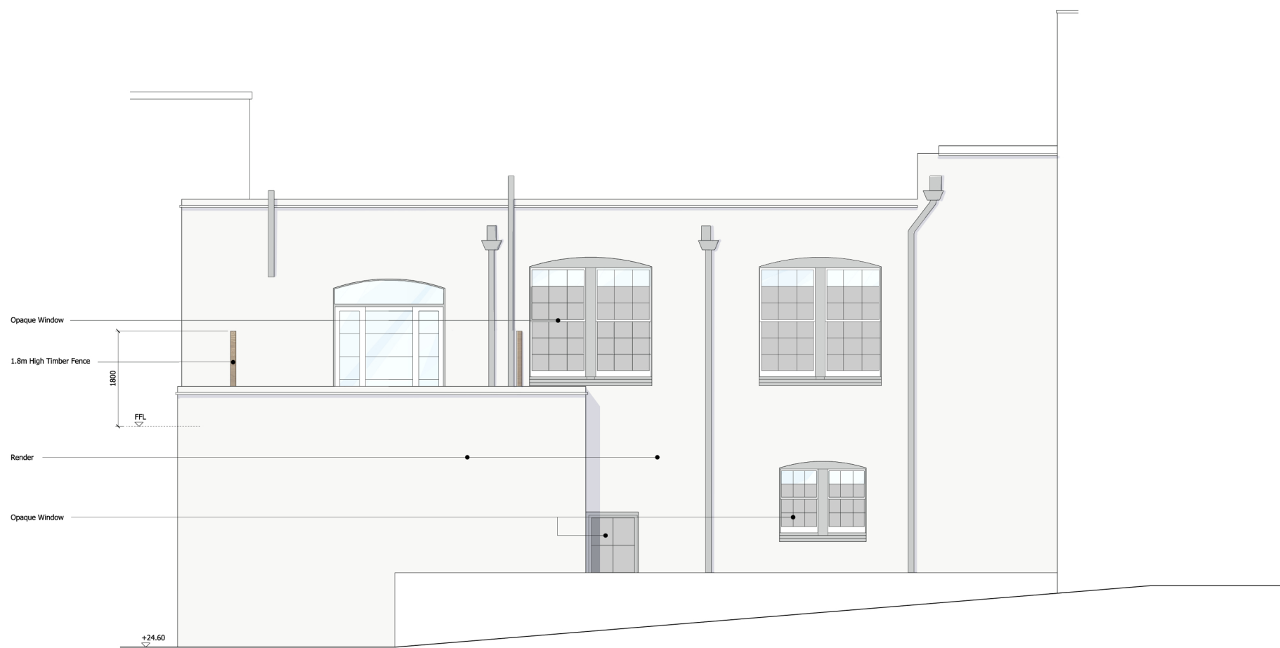
02 BLOCK D - EAST ELEVATION