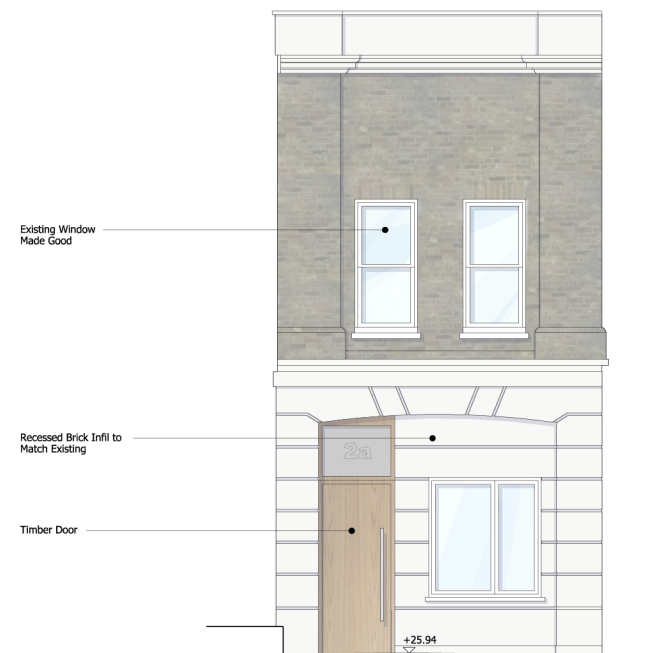
03 BLOCK D - NORTH ELEVATION