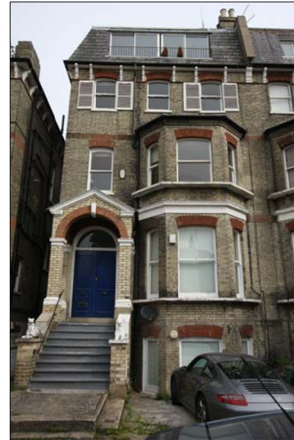
01 PHOTOGRAPH OF EXISTING FRONT ELEVATION PL03