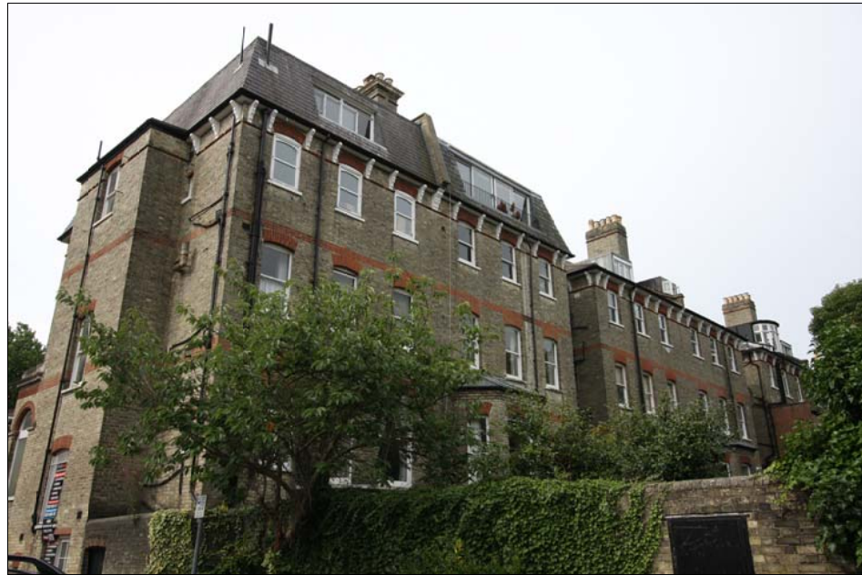
01 PHOTOGRAPH OF EXISTING REAR ELEVATION PL03