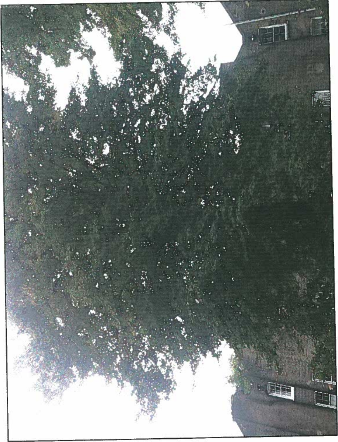
Lime Tree 20 Agreenland Road