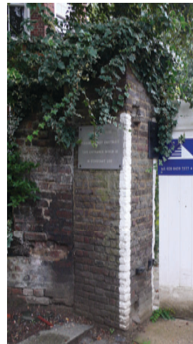
Remaining left hand pier to gate