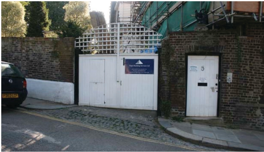
Existing bin store and pedestrian entrance