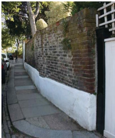
Poor quality repair adjacent to bin store