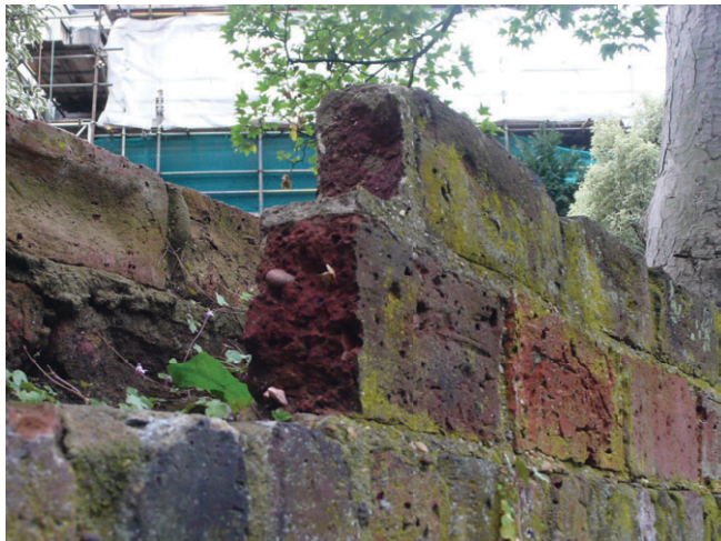
Brick planters in poor condition