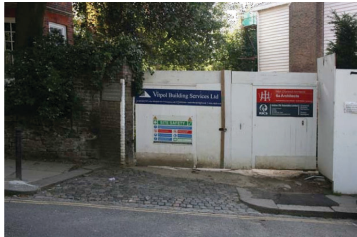
Existing gate (right hand pier currently demolished)