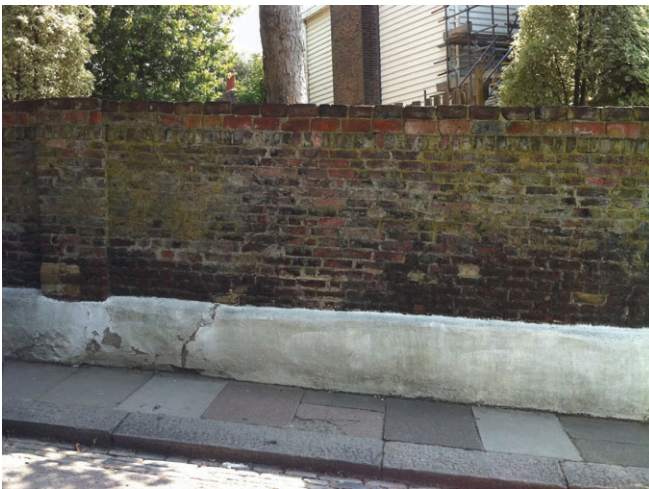
Existing wall condition: 2no. brick planter courses above old soldier course