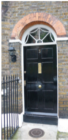
Existing black painted doors to adjacent properties