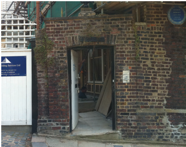
Poor quality repair to mortar around main pedestrian entrance