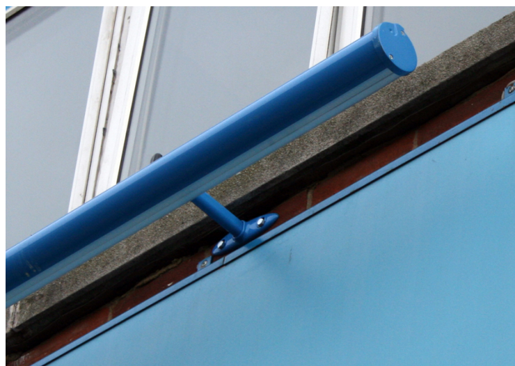
photograph of Microlux Slimline strip sign lighting from below. Projection is 200mm max.