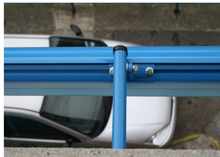
photograph of Microlux Slimline strip sign lighting from above. all light is directed downwards.