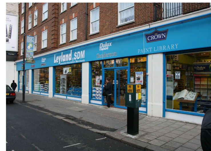
photograph of Microlux Slimline strip sign lighting as installed at Leyland SDM shop on Fulham Rd.