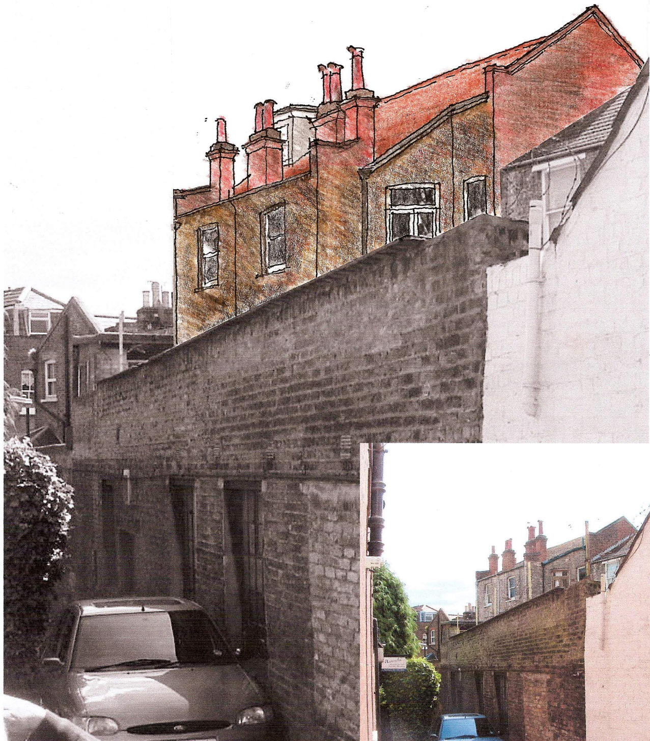
VIEW FROM LOCATION A PROPOSAL