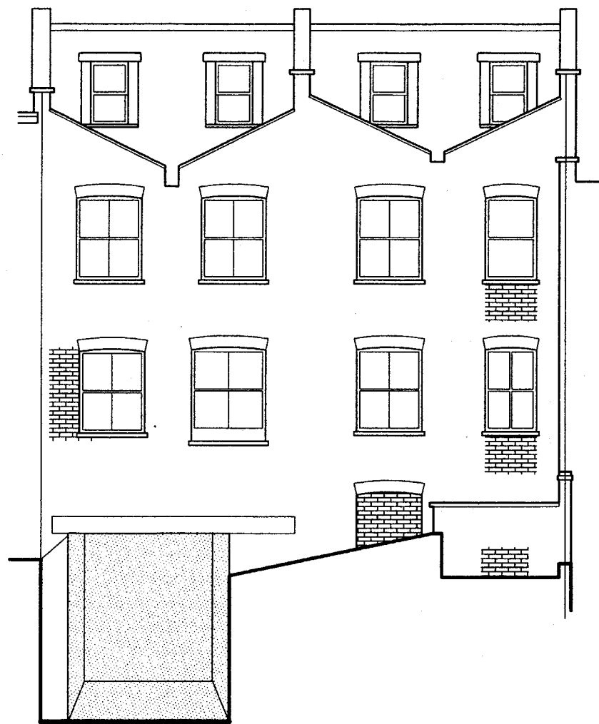
Proposed Rear Elevation ( Section A - A )