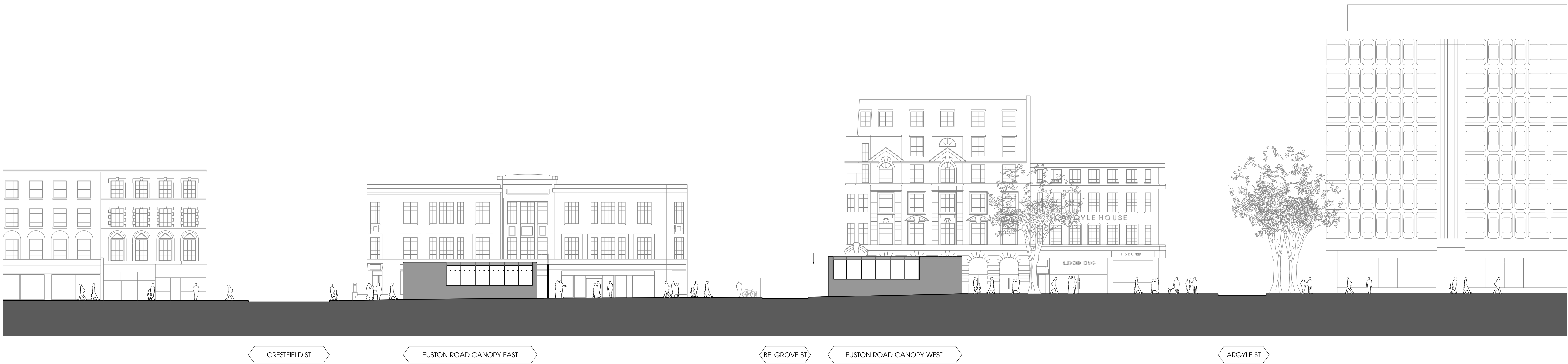
0007 | SITE SECTION FF Refer to Drawing CAP-0001