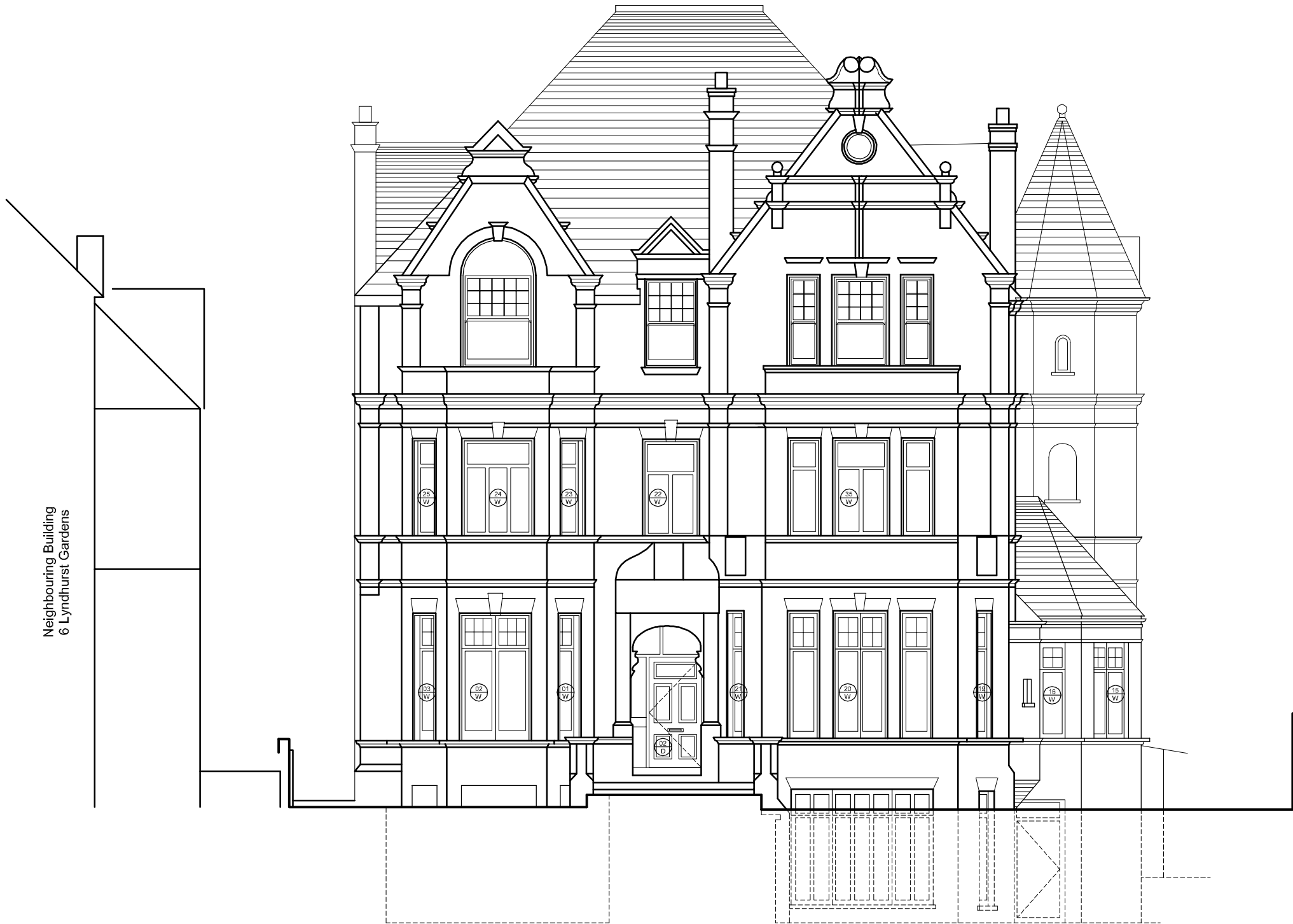
PROPOSED NORTH ELEVATION - FRONT (no work proposed)