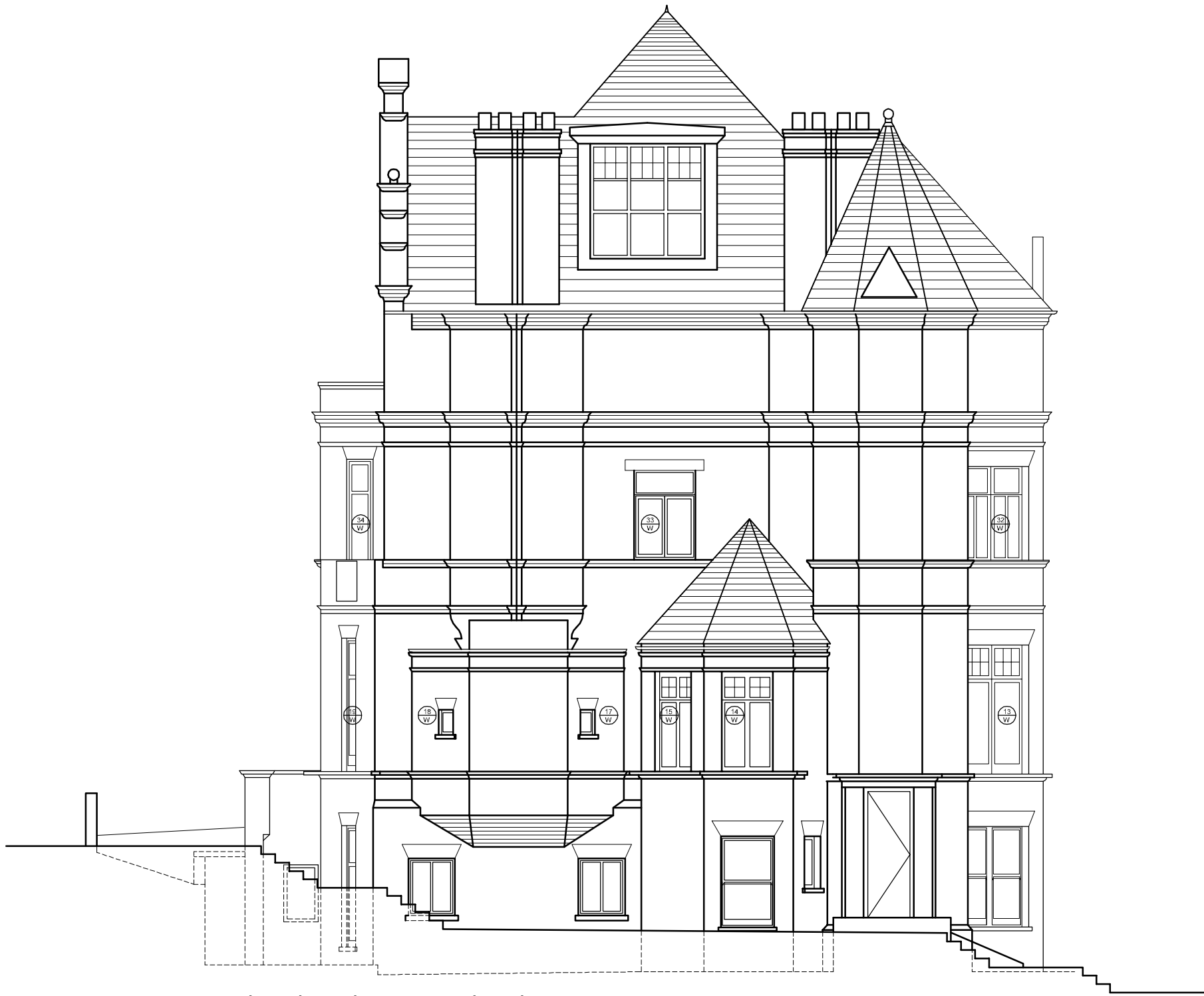
EXISTING WEST ELEVATION - SIDE