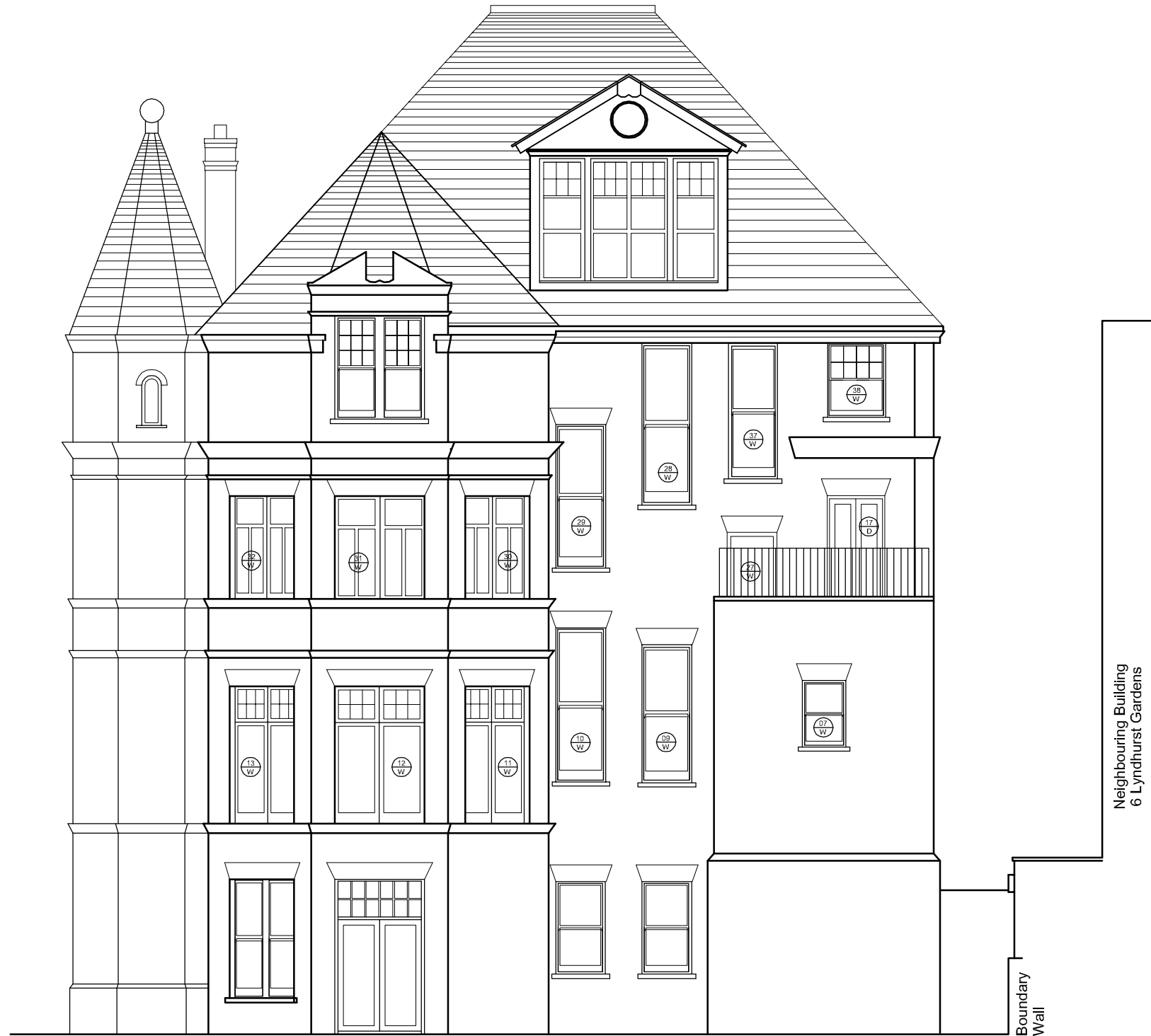
EXISTING SOUTH ELEVATION - REAR