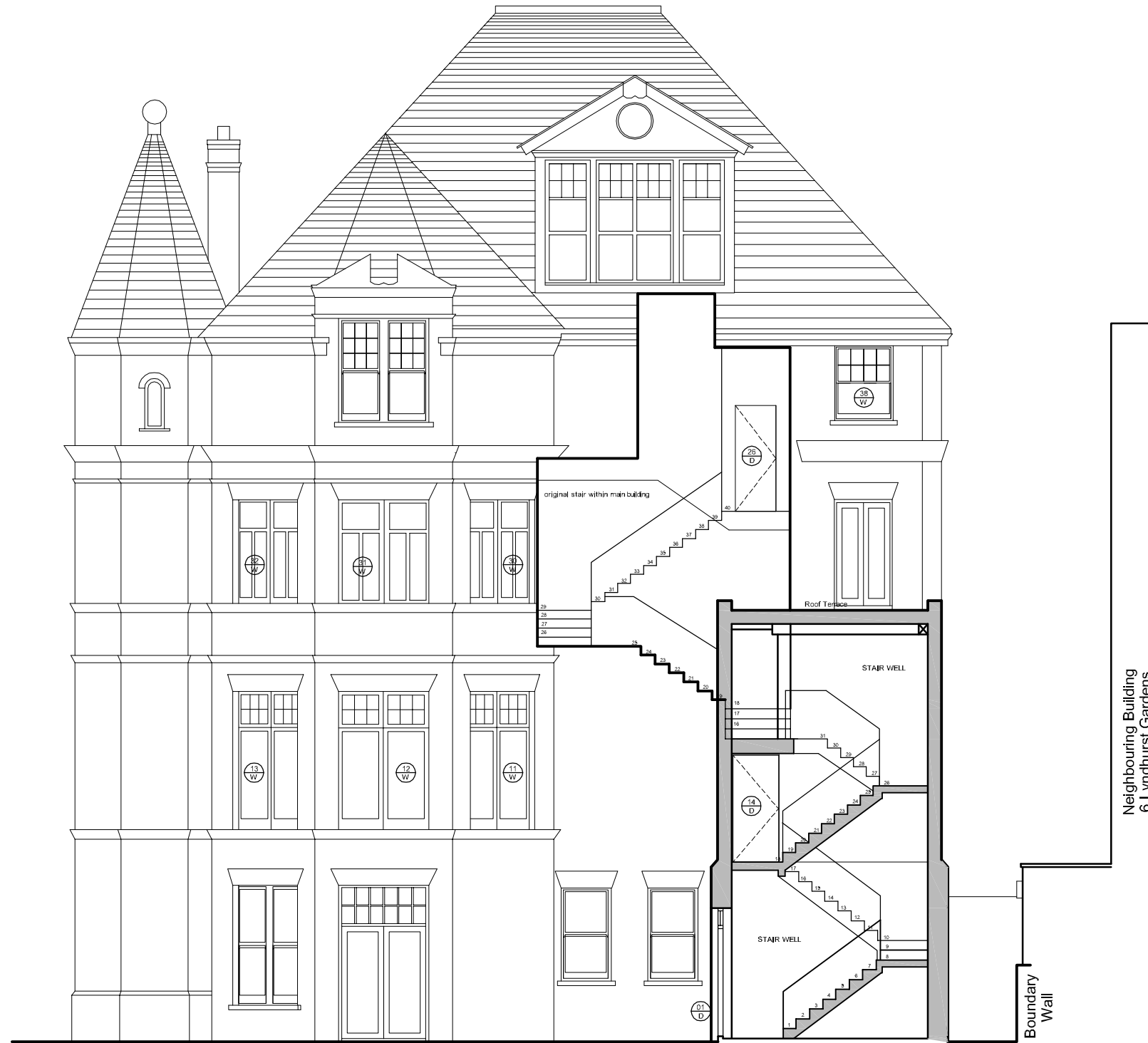
EXISTING STAGGERED SECTION CC - THROUGH STAIRCASES