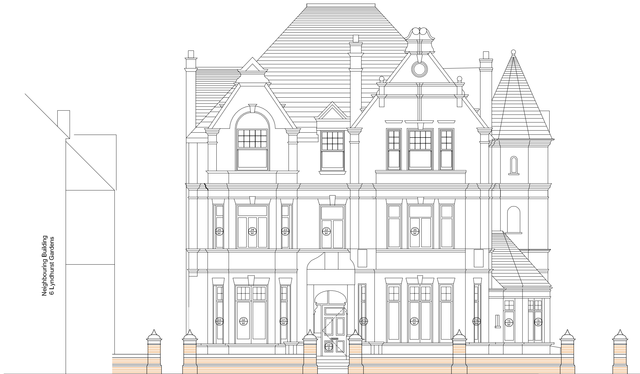
EXISTING NORTH ELEVATION - VIEWED FROM ROAD