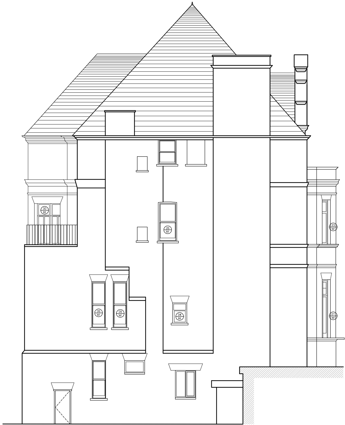
EXISTING EAST ELEVATION - SIDE