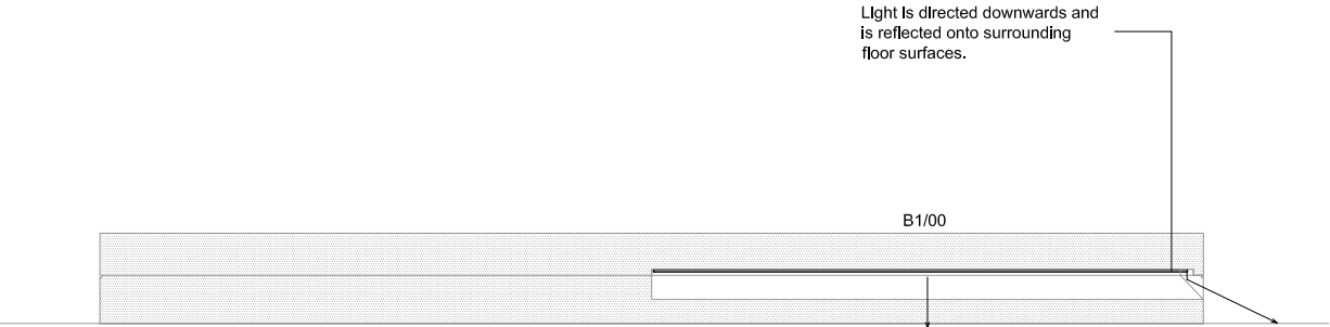
Kings Cross Square Bench, Elevation B-B, scale 1:20 @ A1