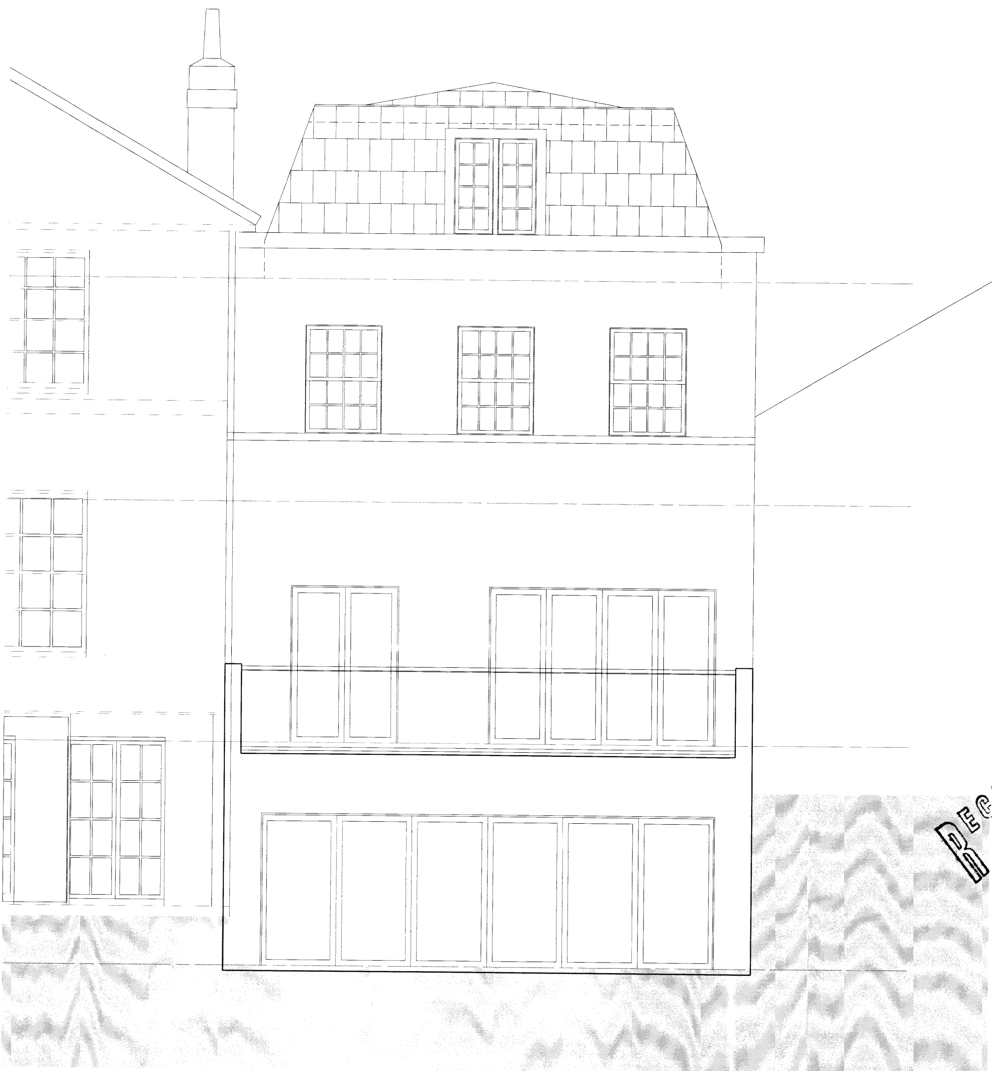
B Proposed Rear Elevation