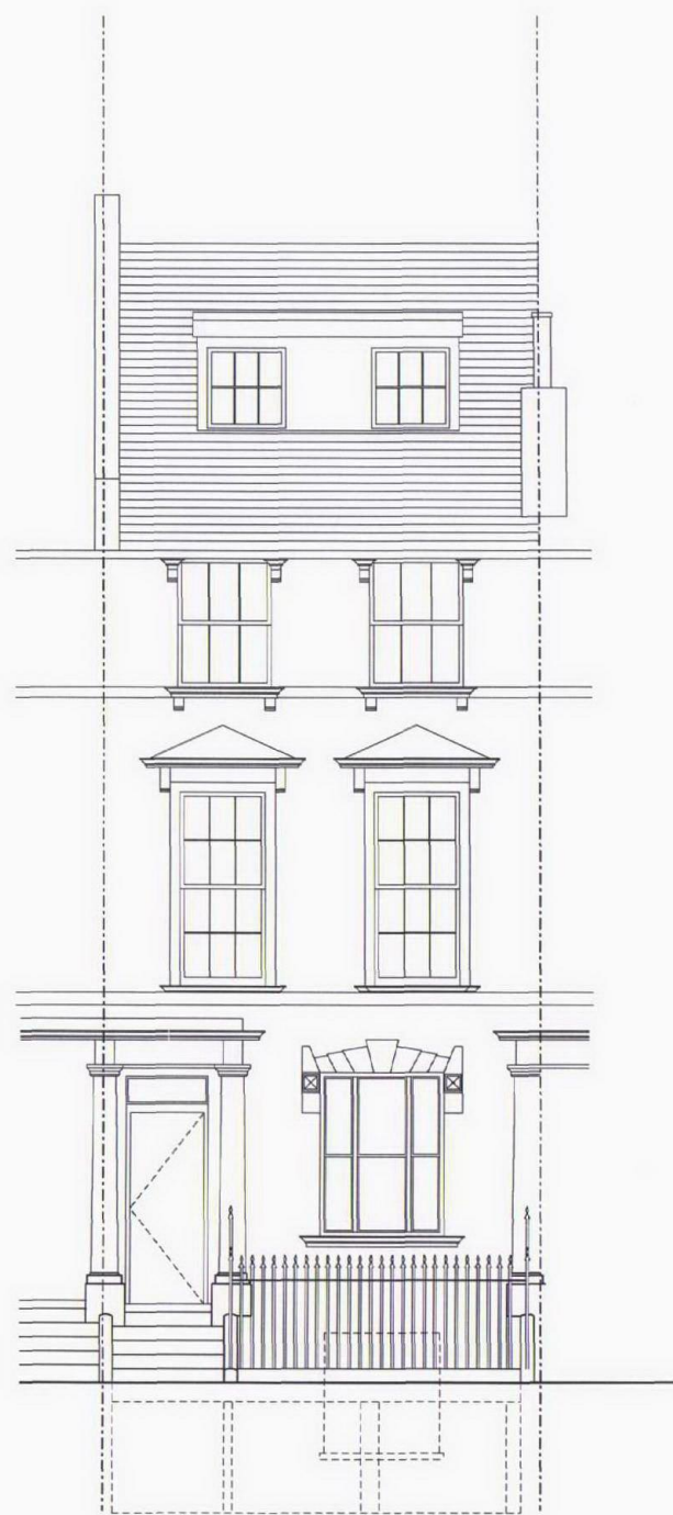
Front Elevation - Existing