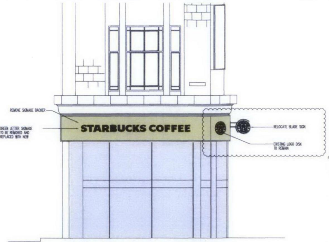
1 LAWFUL STORE FRONT ELEVATION