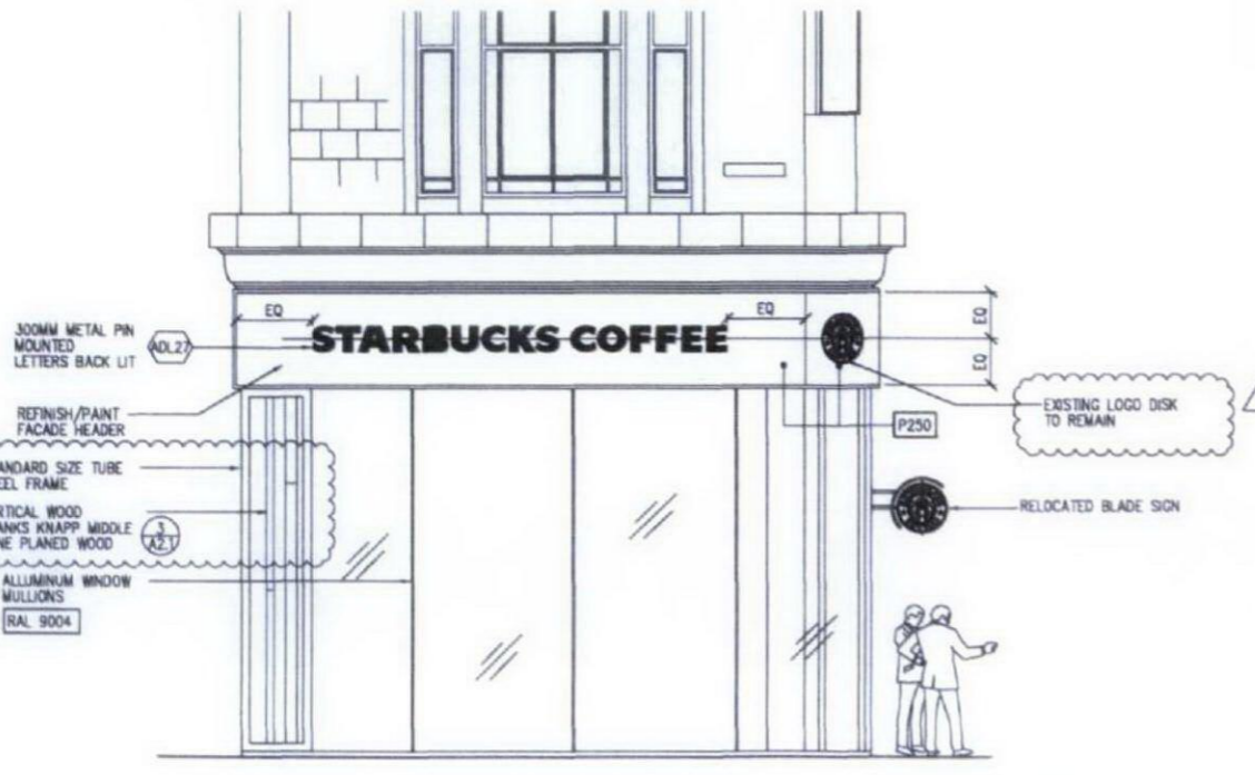
2 EXISTING UNAUTHORISED STORE FRONT ELEVATION