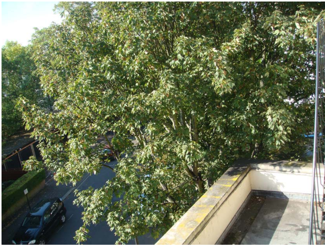
Sycamore and lime - seen from the rear garden of 53 Priory Road :