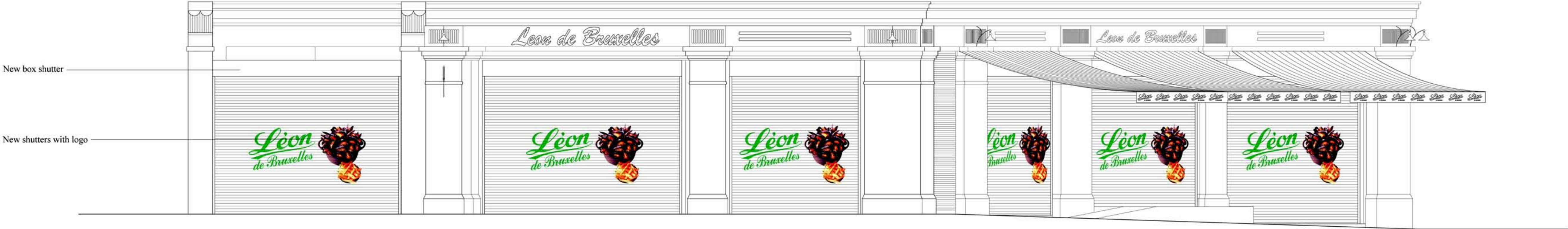
CHARING CROSS ROAD ELEVATION Scale 1:50 @ A1

NOTES: DO NOT SCALE: ALL DIMENSIONS TO BE CHECKED AND VERIFIED WITH ARCHITECT / INTERIOR DESIGNER PRIOR TO CONSTRUCTION