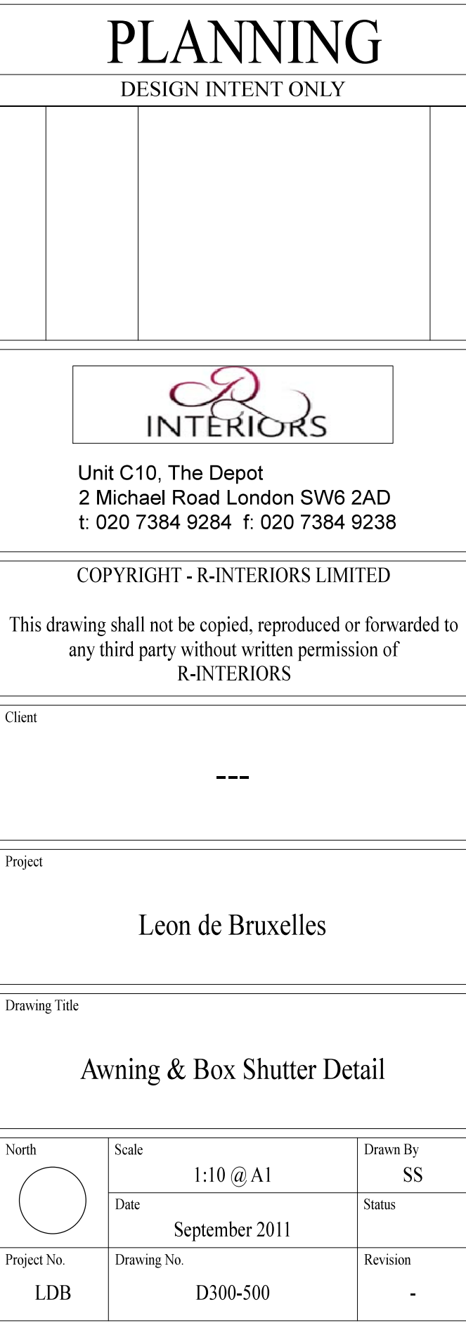
TYPICAL BOX SHUTTER & AWNING SECTION Scale 1:10 @ A1