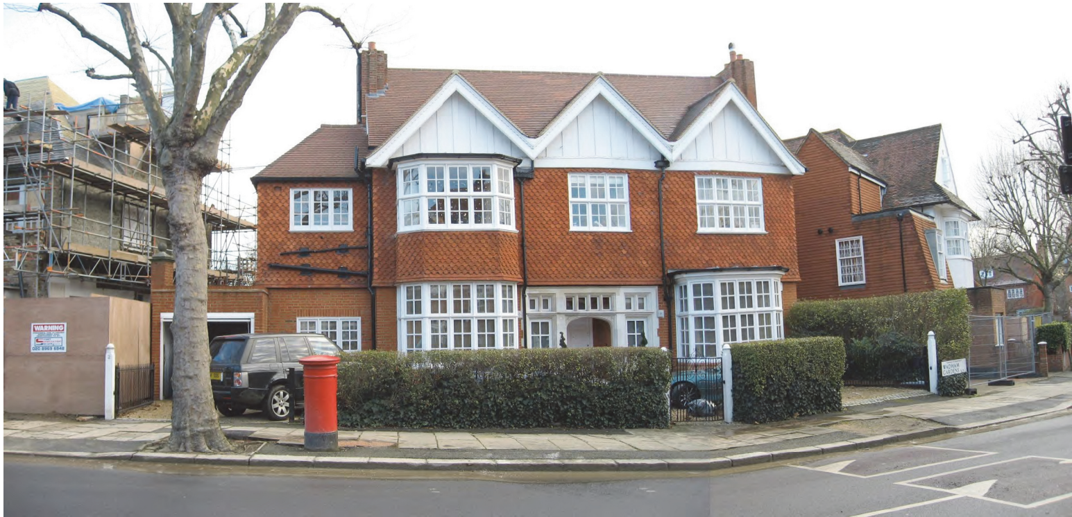
Photograph showing the front elevation of No. 2 Wadham Gardens, NW3.