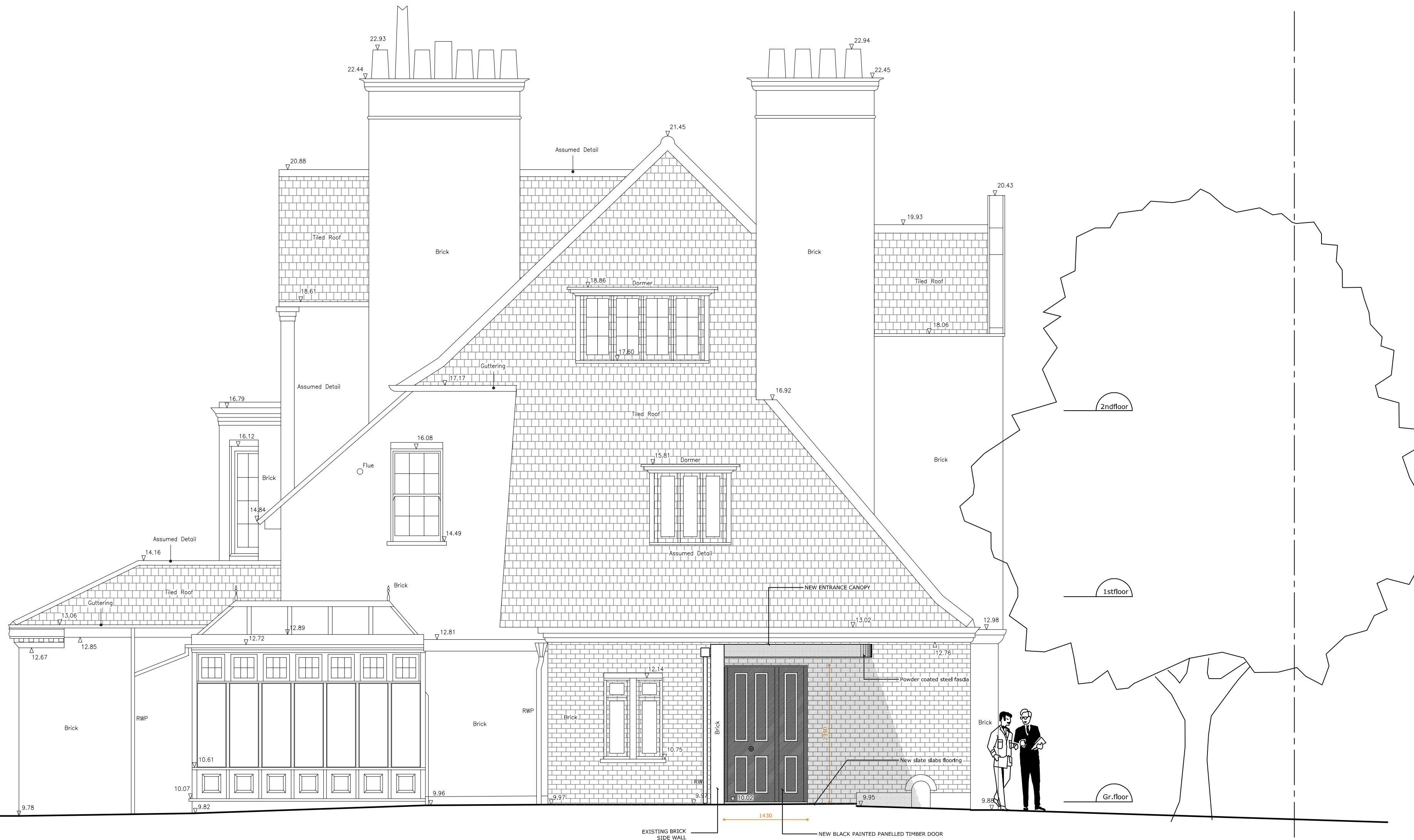
SIDE ELEVATION ( EAST )