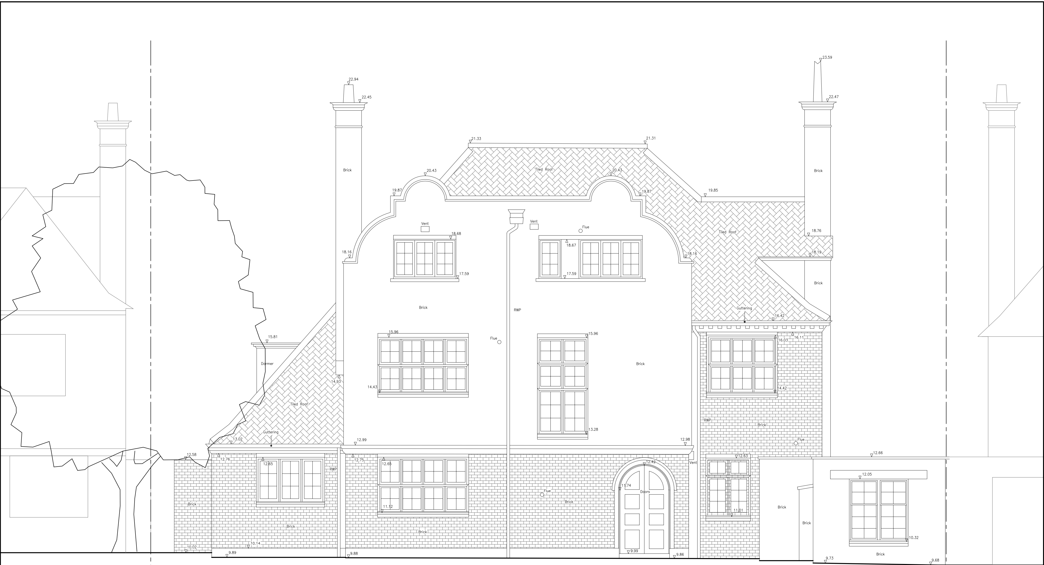
FRONT ELEVATION (NORTH)

1. Copyright of this drawing belongs & is vested in Archic Architectures chics and may not be reproduced or distributed in any way or for any purpose without written consent by Archic. This document is the property of Archic and copyright is reserved by them. 2. All dimensions to be checked on site by contractor prior to commencement of works. Do not scale from the drawings. Any discrepancies are to be notified to the Project manager. 3. Drawings indicates design intent only.